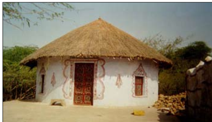
Figure 5: Typical adobe bhonga in India (WHE Report 72)

typical of the Gujarat state in India. It consists of a single cylindrically shaped room with conical roof supported by cylindrical walls. It also has reinforcing bonds at the lintel and collar level, made of bamboo or reinforced concrete.