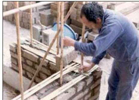
Figure 8: Tying adobe reinforcement (Blondet et al. 2002, referenced in EERI adobe tutorial)

Additional wall reinforcement should also be provided. This reinforcement can be made of any strong, ductile material, such as bamboo, cane, reeds, vines, rope, timber, chicken wire, barbed wire, or steel bars. Vertical reinforcement helps to tie the wall to the foundation and to the ring beam and restrains out-of-plane bending and in-plane shear. Horizontal reinforcement helps to transmit the out-of-plane forces in transverse walls to the supporting shear walls, as well as to restrain the shear stresses between adjoining walls and to minimize vertical crack propagation. The horizontal and vertical reinforcement should be tied together and to the other structural elements to provide a stable matrix that will maintain the integrity of the walls after they have broken into large pieces.