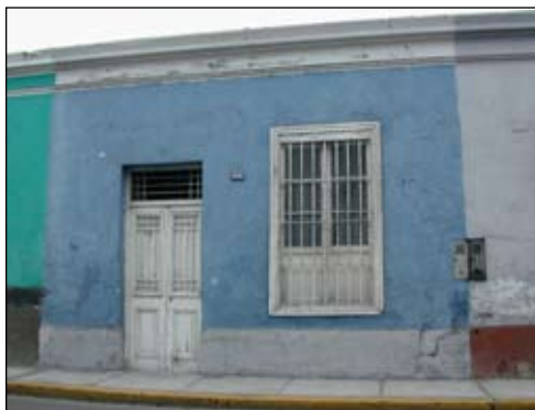
Figure 1: Typical adobe house (WHE Report 52, Peru)

Worldwide use of adobe is mainly in rural areas, where houses are typically one story, 3 m high, with wall thicknesses ranging from 0.25 m to 0.80 m. In mountainous regions with steep hillsides, such as the Andes, houses can be up to three stories high. In parts of the Middle East, one finds that the roof of one house is used as the floor of the house above. Urban adobe houses are found in most developing countries. However, they are not permitted by building codes in countries like Argentina, or in specific cities like San Salvador due to their poor seismic behavior.