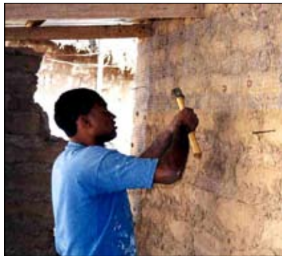
Figure 9: Nailing the wire mesh (Zegarra et al. 1997, referenced in the EERI adobe tutorial)

Dynamic tests conducted by researchers in Peru have demonstrated that a good solution for existing adobe houses is an external reinforcement consisting of wide strips of wire mesh (1 mm wires spaced at \frac{3}{4} inches) nailed with metallic bottle caps against the adobe as shown in the figure below (Zegarra et al. 1997, referenced in WHE adobe tutorial). The mesh is placed in horizontal and vertical strips simulating beams and columns and is covered with cement and sand mortar. Several houses reinforced with this technique did not suffer any damage during the 2001 earthquake in the south of Peru, even though similar unreinforced houses in the vicinity collapsed or suffered significant damage.