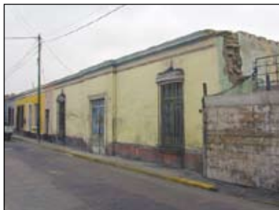
Figure 3: Typical adobe house in the coastal area

Architectural characteristics are similar in most countries: the rectangular plan, single door, and small lateral windows are predominant. Quality of construction in urban areas is generally superior to that in rural areas. The foundation, if present, is made of medium-to-large stones joined with mud or coarse mortar. Walls are made with adobe blocks joined with mud mortar. Sometimes straw or wheat husk (WHE Report 23, India) is added to the soil used to make the blocks and mortar. The size of adobe blocks varies from region to region. In traditional constructions, wall thickness depends on the weather conditions of the region. Thus, in coastal areas with a mild climate, walls are thinner than in the cold highlands or in the hottest deserts. The roof is made of wood joists (usually from locally available tree trunks) resting directly on the walls or supported inside indentations on top of the walls. Roof covering may be corrugated zinc sheets or clay tiles, depending on the economic situation of the owner and the cultural inclinations of the region. A traditional adobe house that exhibits good seismic behavior is the bhonga type,