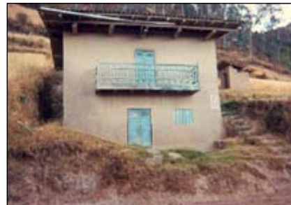
Figure 4: Typical adobe house in the highland area

typical of the Gujarat state in India. It consists of a single cylindrically shaped room with conical roof supported by cylindrical walls. It also has reinforcing bonds at the lintel and collar level, made of bamboo or reinforced concrete.