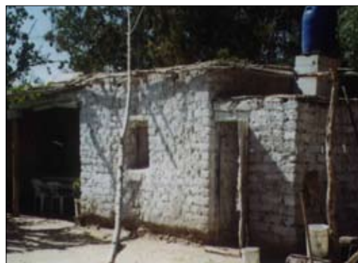
Figure 2: Typical adobe house (WHE Report 89, Argentina)