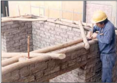
Figure 7: Crown beam made of eucalyptus trunks (Blondet et al. 2002, referenced in EERI adobe tutorial)

The most important factor for the improved seismic performance of adobe construction is to provide reinforcement for the walls. Earthquake shaking will cause adobe walls to crack at the corners and to break up in large blocks. The role of the reinforcement therefore is to keep these large pieces of adobe wall together. A ring beam (also known as a crown, collar, bond, or tie-beam, or seismic band) that ties the walls in a box-like structure is one of the most essential components of earthquake resistance for load-bearing masonry construction. The ring beam must be strong, continuous, and well tied to the walls, and it must receive and support the roof. The ring beam can be made of concrete or timber.