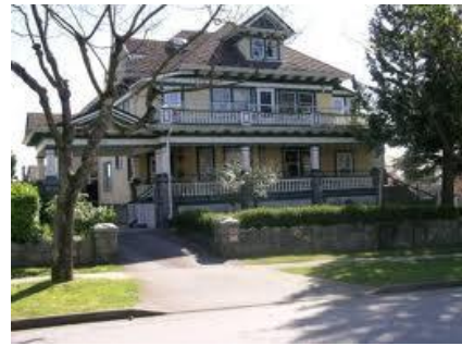
Photo of the Banff and Vancouver Abbeyfield Shared House for Seniors