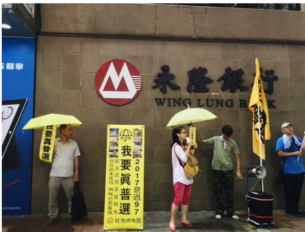
A pro-democracy demonstration in Mongkok

Hong Kong’s pro-democracy protests garnered worldwide media attention and became known as the Umbrella Movement in 2014. Protestors demonstrated against China’s interference in the election of the next Chief Executive. 46 The Umbrella Movement demands an electoral