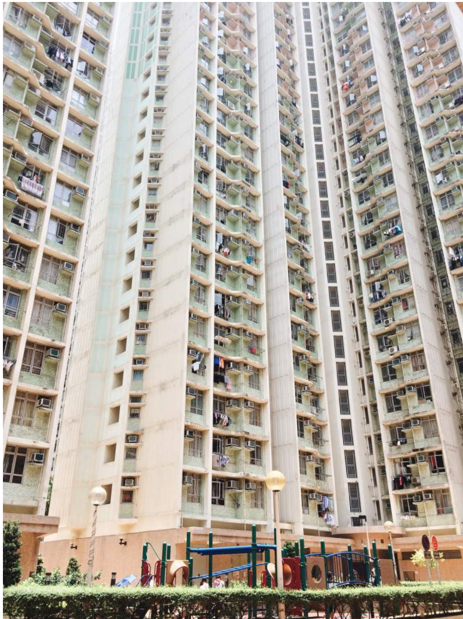
A playground in front of a public housing estate

about being “cut off from the rest of society.” 22 Income segregation breaks down local urban economies, encourages crime, and limits social and economic opportunities for the poor. 23 The geographic proximity of different income groups helps to create safe and vibrant communities in Hong Kong.