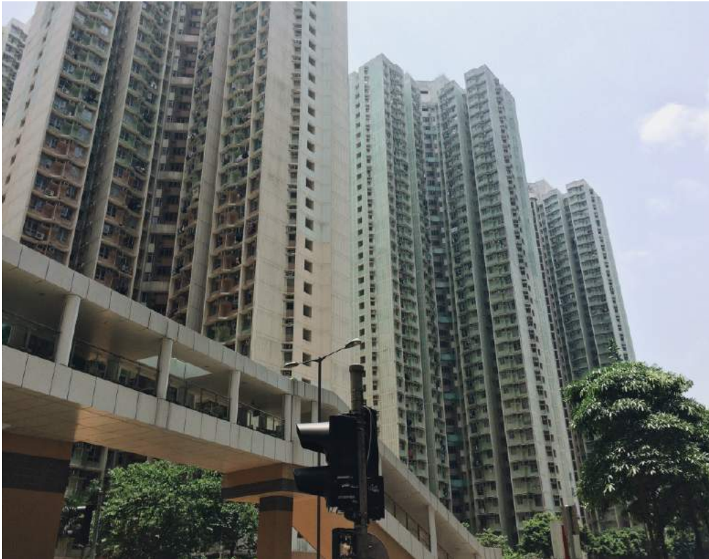
Public housing estates near an MTR stop in the New Territories