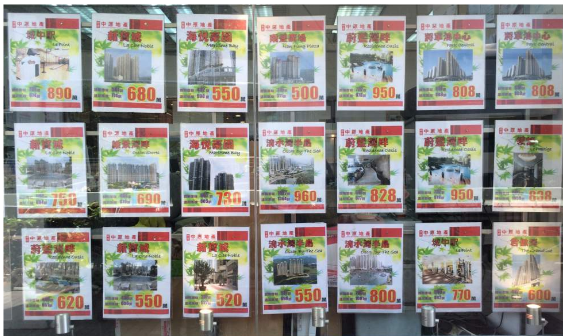
Signs for rent at a real estate office

The “Masterpiece” is another example of the URA’s profit-driven redevelopment projects. 20 In 2009, the URA and New World Development jointly developed area in Tsim Sha Tsui. Each flat in the completed project sold at more than HK$30,000 per square foot. 21 The original residents moved away because they could not pay the exorbitant housing prices. Wealthy Mainland investors purchased the property hoping to profit from the redevelopment project.