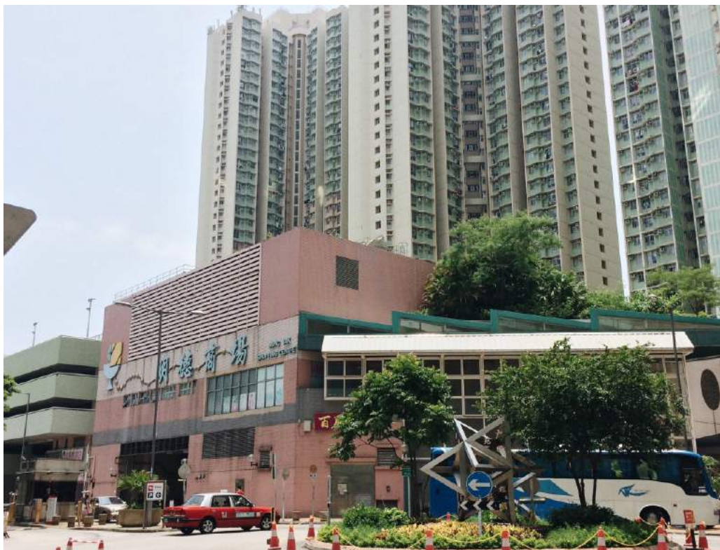
An inoperative supermarket at a public housing estate in Tseung Kwan O