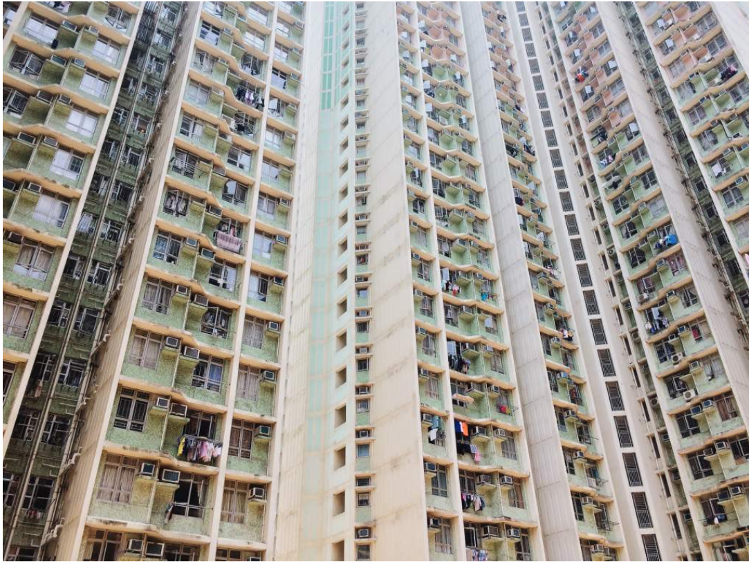
Public Housing flats near Hang Hau Station