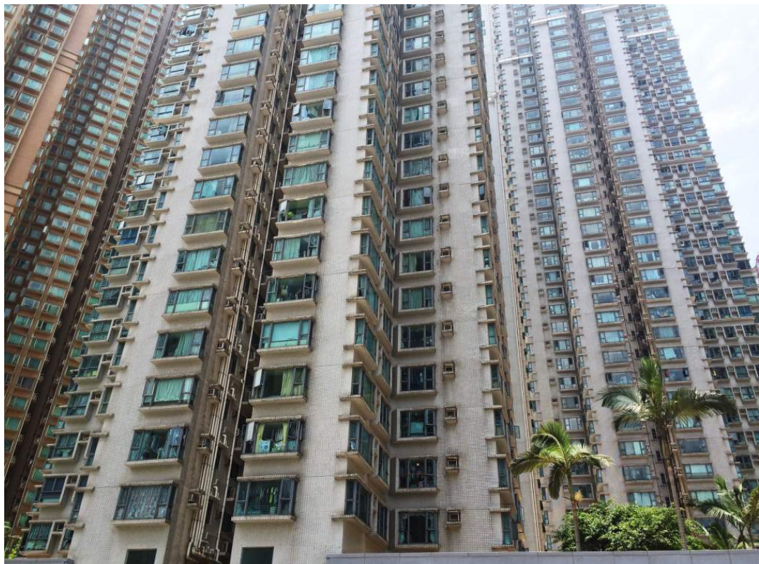
Private Housing flats near Hang Hau Station