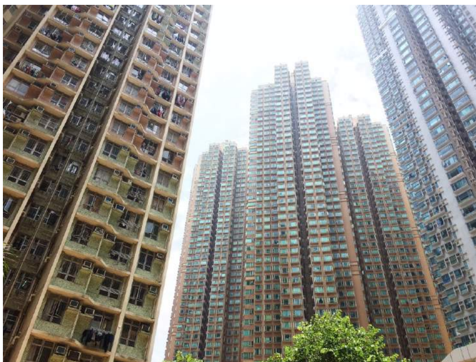
Public (far left) and private housing estates built besides each other

The Authority spends about HK$260 million on building rehabilitation every year, but this amounts less than to what the organization spends yearly on administrative expenses. 26 In 2013, the URA spent only HK$65 million on building rehabilitation loans out of its total assets of HK$32 billion. 27 An organization’s distribution of funds and resources is a strong indicator of its values and interests.