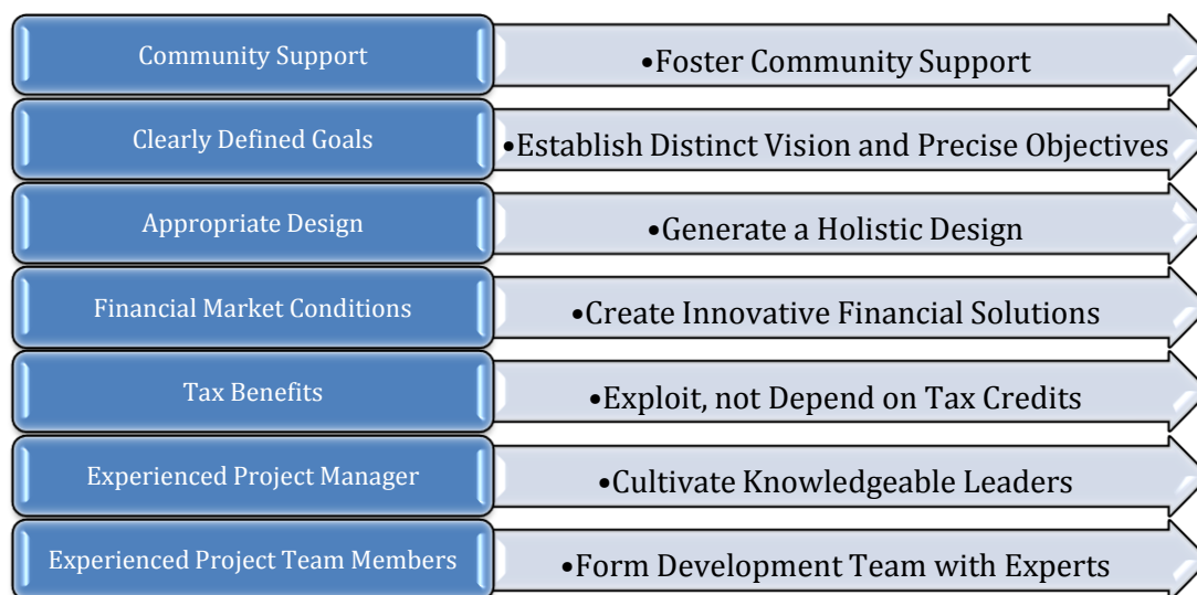
Figure 6.2 – Recommendations for Successful Affordable Housing by CSFs

Using the information gathered during the interview and analysis processes of this report, led to the identification of seven critical success factors for affordable housing development. The following sections present and discuss this researcher's recommendations for successful affordable housing development. Figure 6.2 outlines each critical success factor and the corresponding recommendation below.