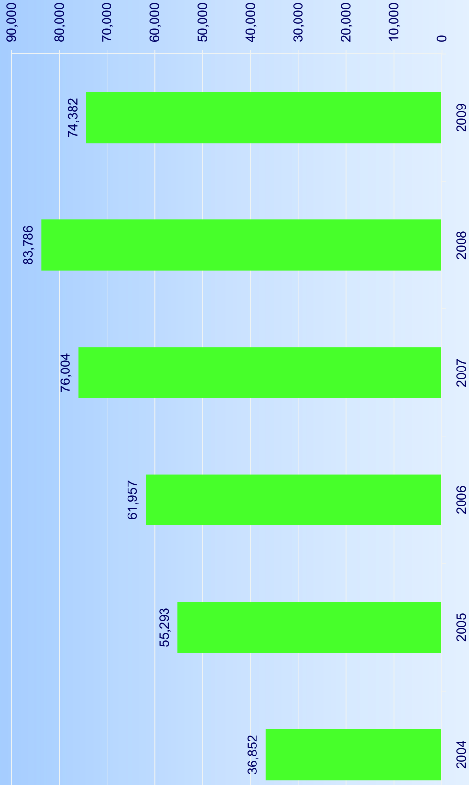
Housing Finance Portfolio (Rs million) (end-Dec figures)