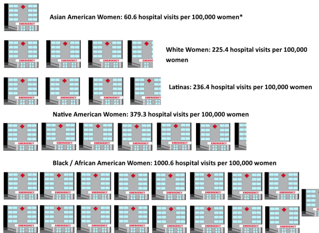
Figure 1. Women's Hospital Encounters Across California per 100,000 Women

* Women's Well Being Index, Women's Foundation of California. Data generated from 2010-2014 American Community Survey by the California Budget & Policy Center.