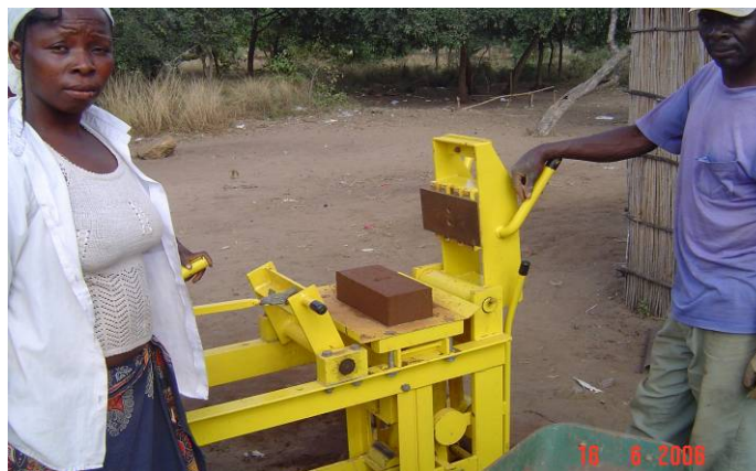
Figure 4: Participation of women in block making, Esteval, Boane, Mozambique, 2006