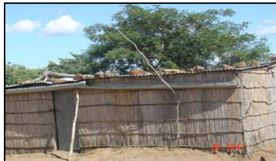
Figure 2: Typical Reed Hut, Estevel, Boane, 2006