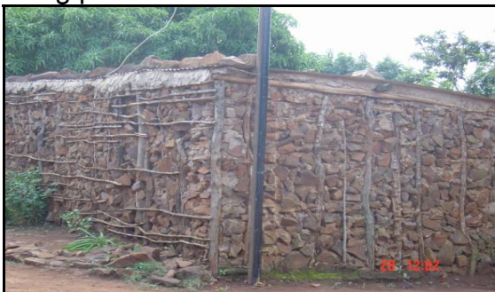
Figure 1: Typical Pau-a-Pic Stone, Pole Dagga hut, Boane, 2006

Predominant materials are, 37,9% of the houses have pau-a-pic barked walls structures; 31,1% in adobe bricks; 75,8% have pavement(floor/foundation) of rammed earth and 74,3% have grass ceiling, stem, palm tree. [9] The improvement of the living conditions and sanitation for the population is heavily linked with the form and adequacy of housing provision.