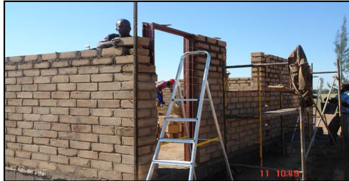
Figure 5: Teacher's house at 19 de Outubro, Estevel, Boane, Mozambique, 2007

The Ministry of Education and Health has built more SSB houses for its civil servants using this technology. The National Reconstruction Programme after Cyclone Flavio floods Relief 2006/7 along Zambezi, Buzi Rivers, saw the establishment of cooperatives for SSB production.