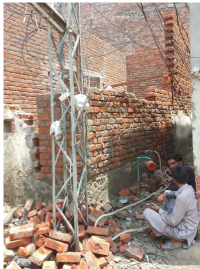
Figure 5. Incremental House construction in Badar Colony, Source: Author

Incremental housing is in full practice for badar colony which shows that once residents start living, they tend to live for longer time periods in most cases (Fig 5). House renovation also demonstrated positive response, however there are some groups of people who were not interested in it. Half of the respondents agreed that legalization of squatter will make majority of the community to go for renovation or incremental construction on basis of secure land tenure.