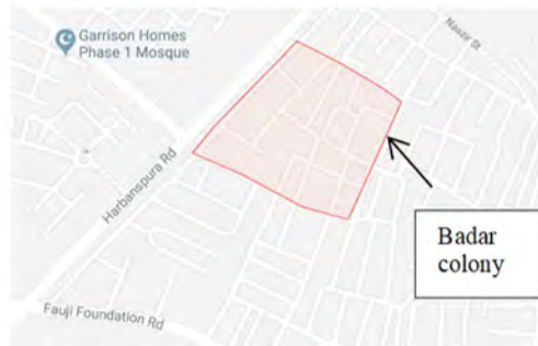
Figure 2. Google map for Badar Colony squatter

Badar Colony is illegalized squatter situated in Sadar near Ranger’s Head Quarter, Lahore on Harbanspura Road (Figure 2). Recent study described the squatter is an informal housing settlement with total of 1300 houses having population figure of 7800. There are two types of tenants here, some of them are urban settlers and other ones are the migrants from nearby suburbs, and villages. Ali Park, Jalal Town and Itthad colony are well-recognized areas near the selected squatter. Out of total population, only 2% have legal status of ownership while rest of the colony is living with unsecure tenure and ownership rights. Recent study revealed that people complain about corruption by official authorities for giving ownership rights and they charged more than RS.172/marla (According to katchi abadi act 1992) from residents of Katchi abadis; there are also some people who don’t even know the procedure of applying for ownership rights (Nasreen & Hira, 2009).