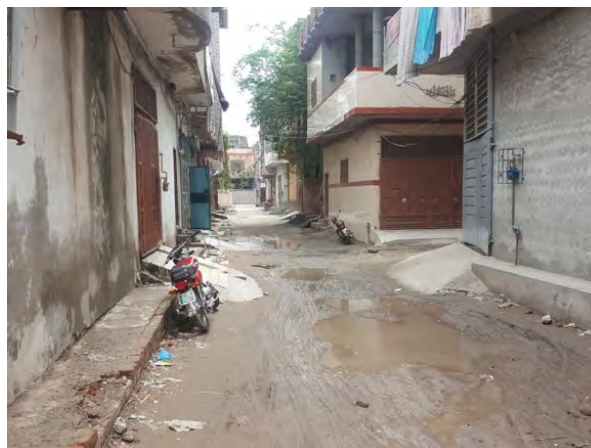
Figure 4. Alley view in Qalandar Pura, Source: Author

Safe and secure environment is merely a feature of such informal housing. However, people were satisfied with safety of environment to some extent. Most of them did not have the idea of safe environment as majority of them are not educated. This can also be linked with absence of active community system for addressing such issues. As a result, hygienic conditions were also not better here (Fig 4). According to the results, kidnapping and robbery activities had not been witnessed by the respondents.