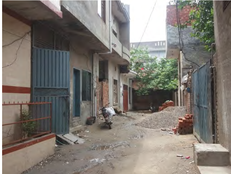
Figure 6. Recent Incremental House construction in Qalandar Pura

Tenants responded in clear positive figure towards the practice of incremental housing in squatter (Fig 6). In addition to this, more than 50% of the respondents acknowledged the exercise of house renovation as well. Since the squatter is already regularized one, so the response about house renovation after squatter up gradation was mixed one but more inclined towards disagreement.