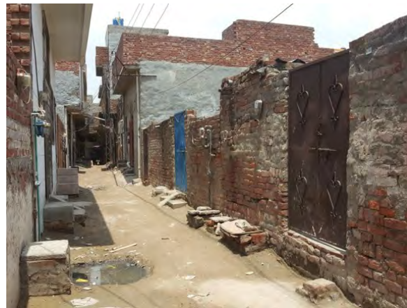
Figure 3. Alley view in Badar Colony

Tenants showed positive response towards the safe and secure environment of squatter. Active Community system was recorded as intergral part of this settlement. However, the hygienic conditions of badar colony were not satisfactory and tenants were not contented about it (Fig 3). On the other hand, due to strong community system, social issues were less such as kidnapping and robbery incidents which are considered to be common aspect of such informal settlements.