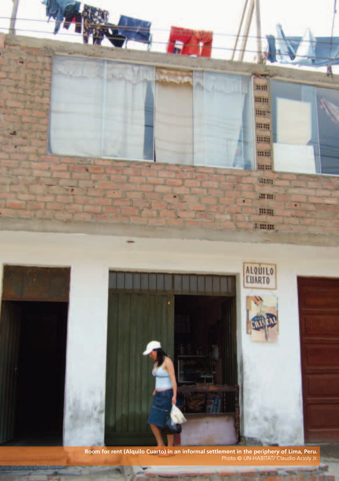
Room for rent (Alquilo Cuarto) in an informal settlement in the periphery of Lima, Peru.