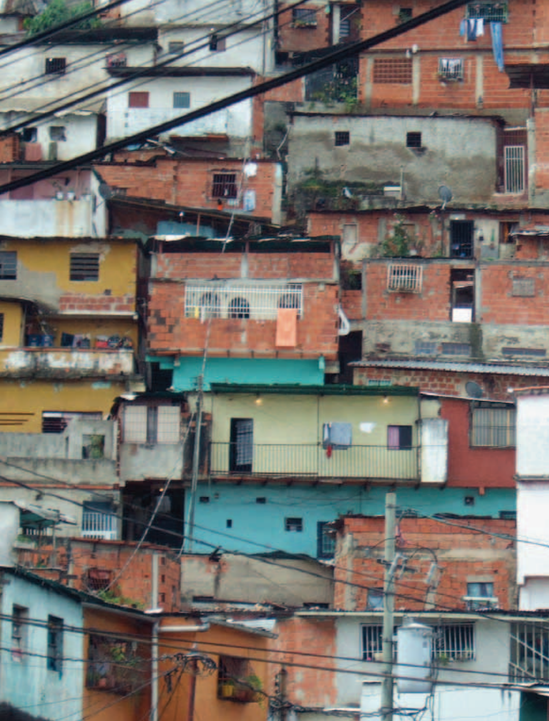
Renting is common in the "villas" of Caracas, Venezuela.