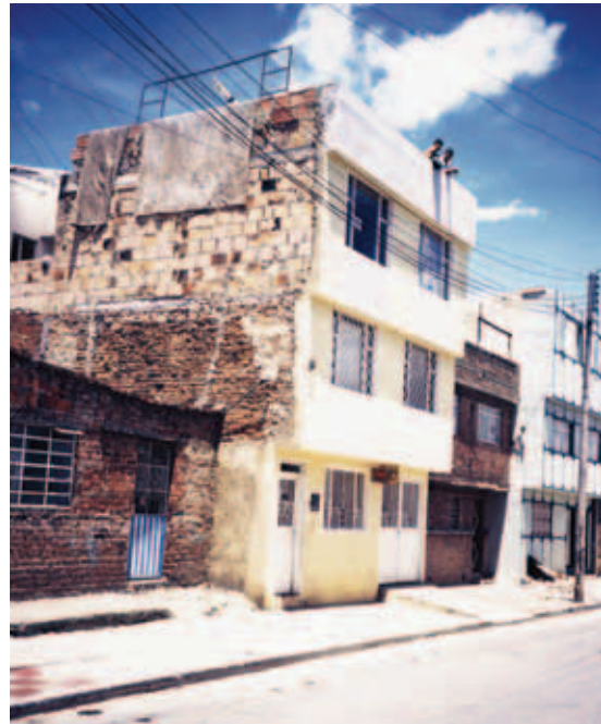
Rental housing produced in Colombia.

As a result, social problems often built up in so-called 'sink estates' and most governments ceased to build for rent. Many attempted to sell off the units to the existing tenants.