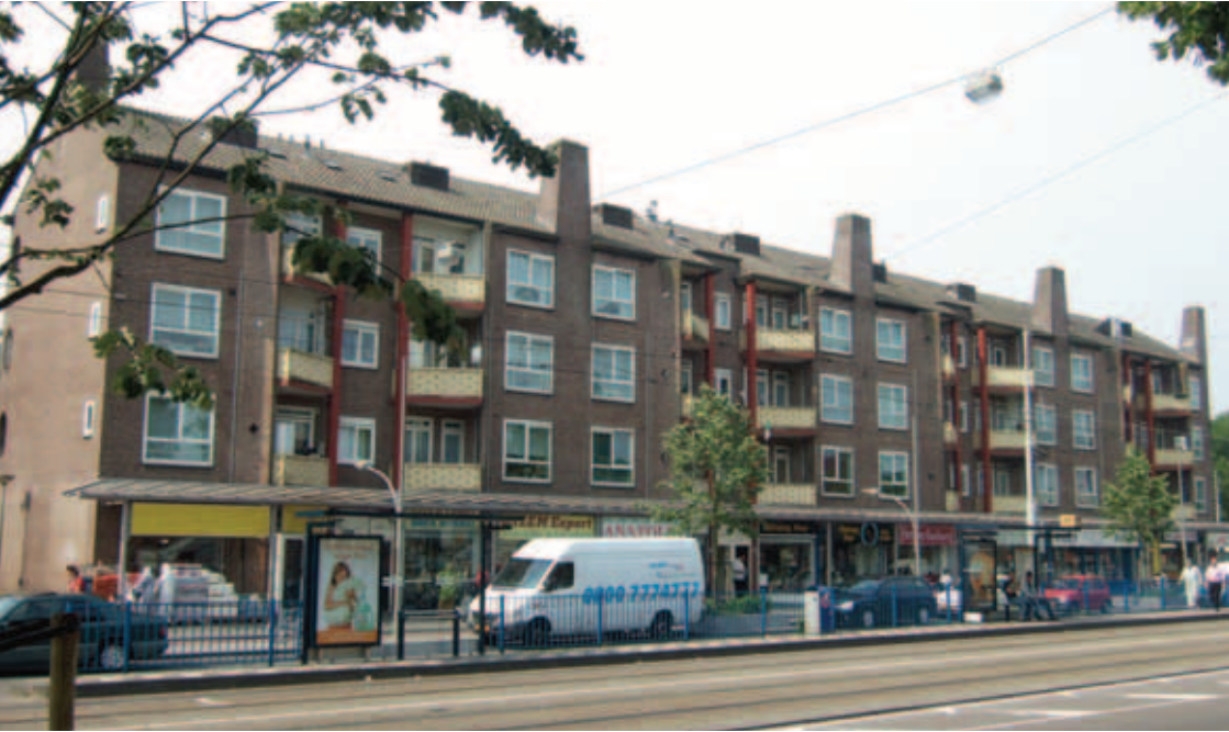
Social Rental Housing produced and managed by Dutch Housing Association, Amsterdam, The Netherlands.