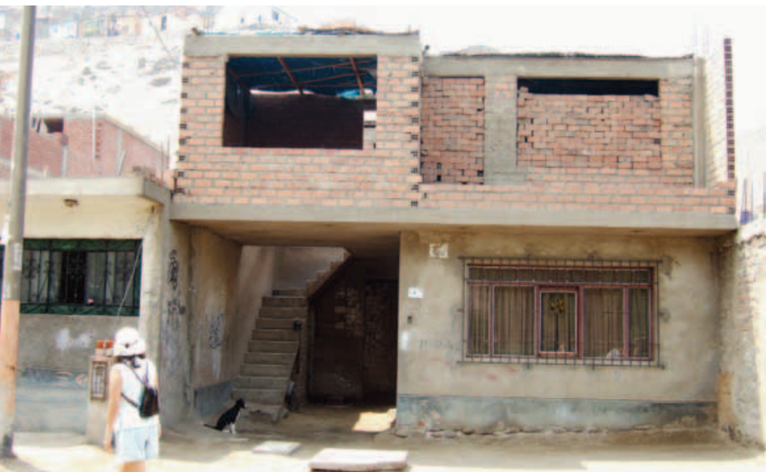
Rental units under construction in informal settlements in the periphery of Lima, Peru.