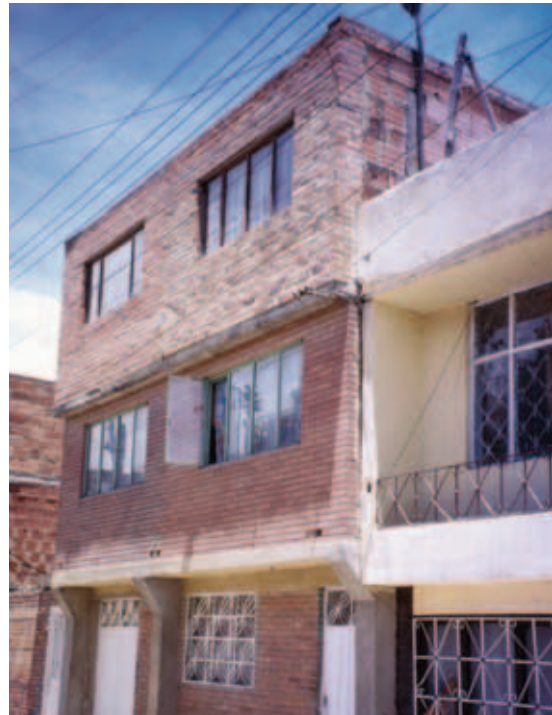
Renting rooms is good business in Latin American Cities.

In terms of dealing with poorly serviced or dilapidated housing occupied by tenants policy should harness and improve the quality of such housing. The worst thing governments can do is to close down or demolish inadequate housing without offering a viable alternative because all that does is bring displacement and increase homelessness. Instead, governments should oblige or persuade landlords to improve services or contribute themselves by providing sanitary facilities as part of settlement upgrading operations.