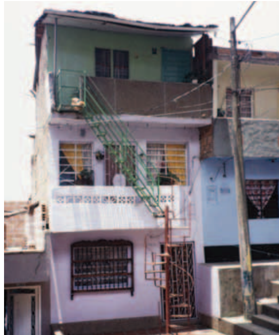
Building rental units require creativity in plot occupation and construction.