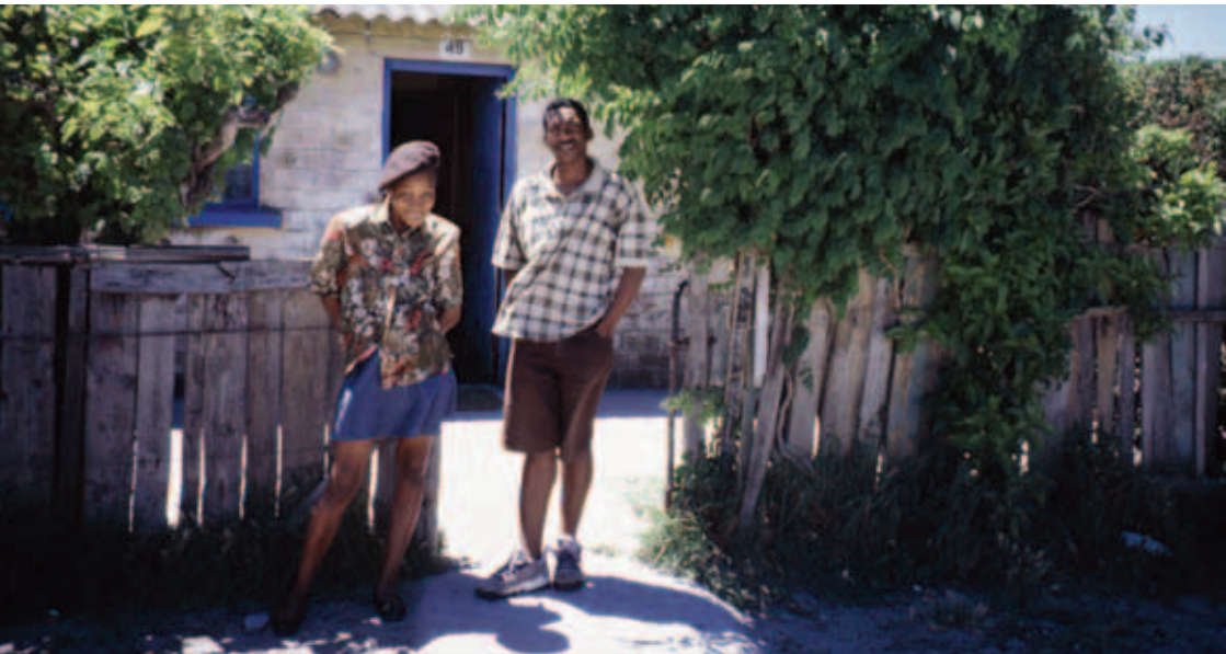
A low-income rental unit in Brazil, Brazil.