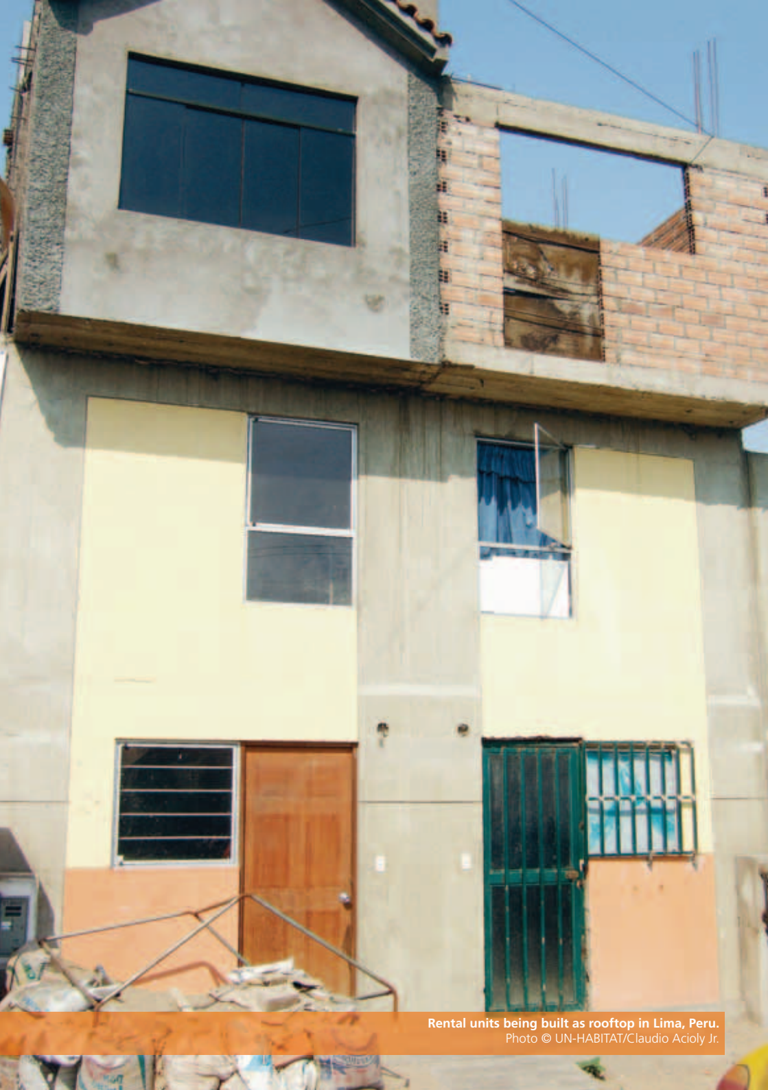
Rental units being built as rooftop in Lima, Peru.