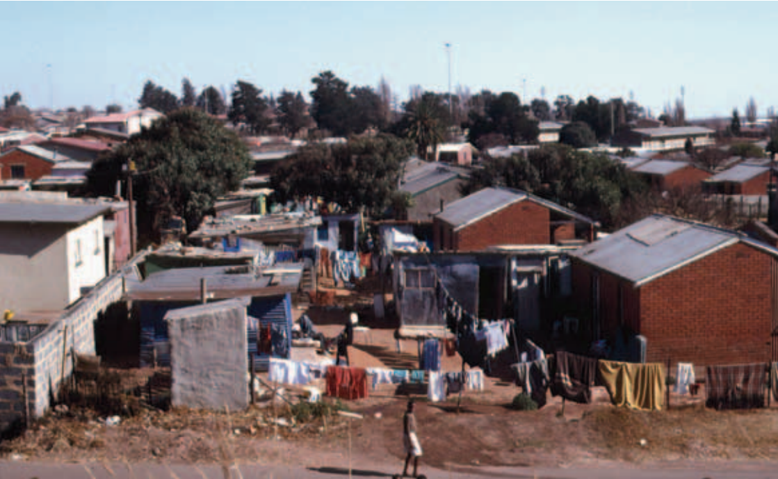
Backyard rental units in South Africa.