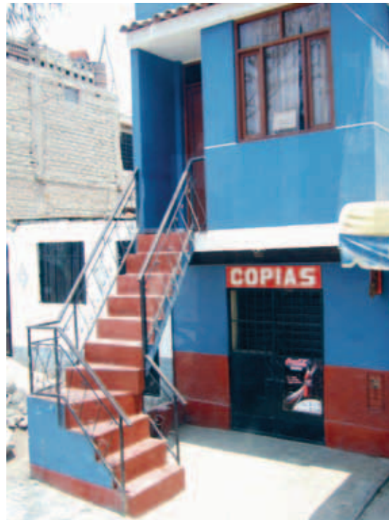
Rental unit combined with commercial unit, self built in a popular neighbourhood in Lima, Peru.

Neither rule gets round the very real problem of inadequate incomes. If a landlord is to provide adequate and well-maintained shelter, a certain level of rent has to be charged. If a tenant is to live in decent accommodation, a certain income has to be earned. The unfortunate feature of most cities in developing countries is that too many people earn very low incomes. In such circumstances rents