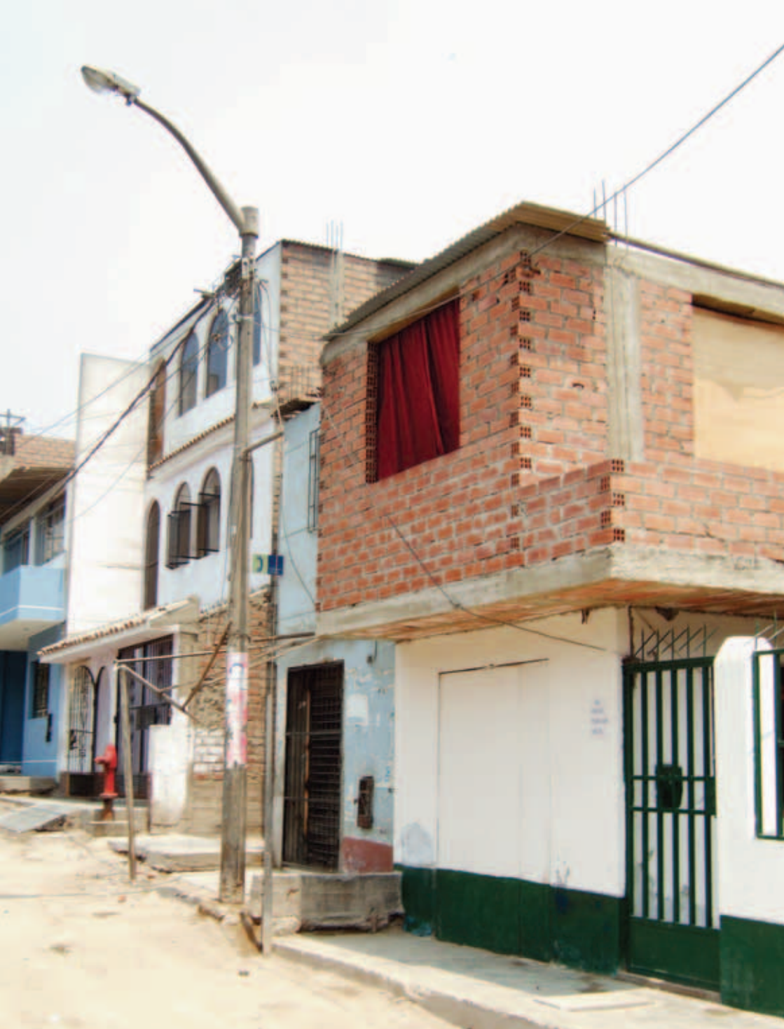
Housing extensions for rental purpose in Lima's popular settlements, Peru.