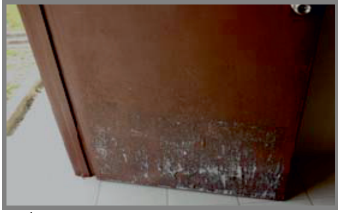
Figure 6. Peeling paint on door

However, damp is less responsible for paint problems. According to data analysis from the questionnaires, approximately 48% of respondents had damp problems. The locations of damp include floors, walls, and ceilings. Damp is caused by weakness of design. Probably the water proofing DPC on the building. From Figure 7, about 56% of houses had leaking pipes. Based on visual inspection, leaking pipes occurred on sinks, because joining pipes were not installed properly. This is due to the quality of materials and workmanship.