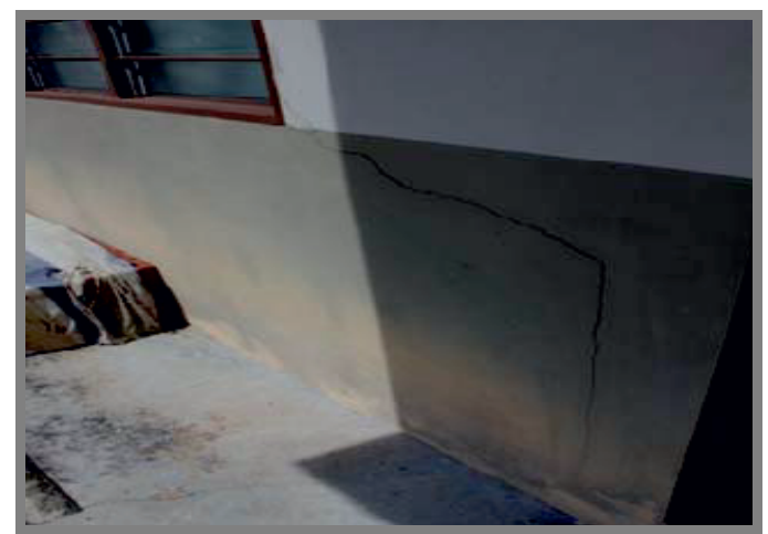
Figure 3. Vertical cracks on an external wall

In Figure 4, the cracks occurred between the wall and the ceiling. Hairlines cracks also occurred on the surface of the ceiling. The probable cause of this crack was vibration and poor workmanship. According to the data analysis from the questionnaire, about 52% of the respondents renovated their own houses. This renovation probably contributed to the causes of the cracking. Vibration, quality of workmanship, and loading change, all occurred when renovation took place. Besides that, the cause of cracking was also a probable factor of subsoil and foundation movement.