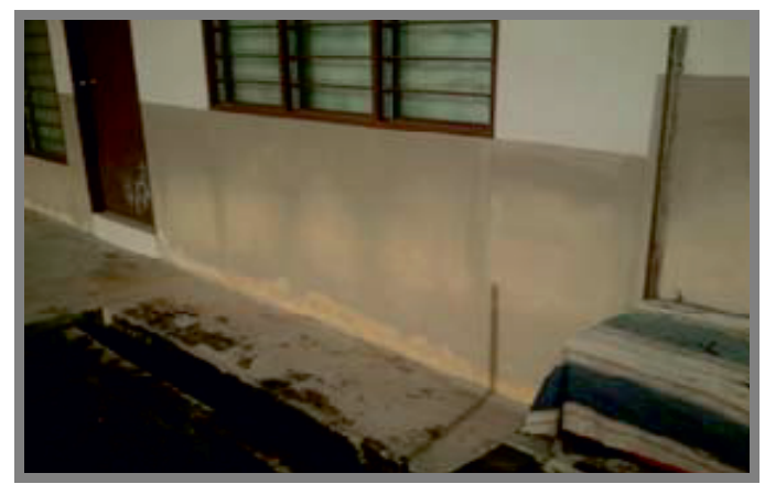
Figure 5. Discoloration on wall area