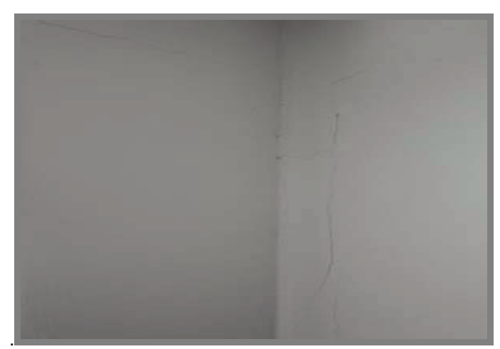
Figure 2. Hairlines cracks on internal walls

From Figure 1, 66% of houses had cracking problems. These cracks occurred in different areas (as shown in Table 1). The three locations that cracks occur are floors, walls, and ceilings. Based on visual inspection, the types of cracks that occur include hairline cracks and vertical cracks. Based on Figure 2, we can determine that hairline cracks on internal bedroom walls have a width of less than 1mm, caused by cement render.