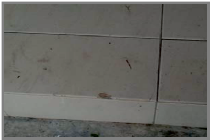
Figure 8. Broken tiles

Besides that, approximately 60% of houses had electrical problems. These problems included faulty electrics, such as in lamps, fans, or switches not functioning. The cause of these defects include the switches not being suited to the capacity used in the house, or not being installed properly. Figure 8 shows that broken tiles caused fewer problems. These causes were due to quality of material and workmanship.