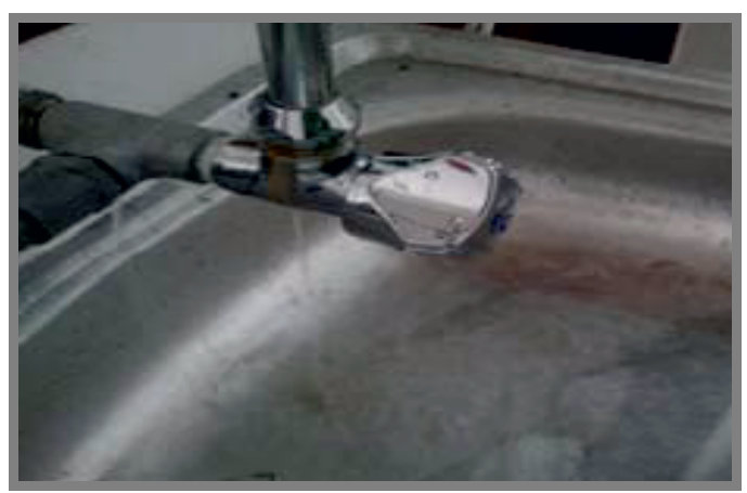
Figure 7. Leaking pipes

However, damp is less responsible for paint problems. According to data analysis from the questionnaires, approximately 48% of respondents had damp problems. The locations of damp include floors, walls, and ceilings. Damp is caused by weakness of design. Probably the water proofing DPC on the building. From Figure 7, about 56% of houses had leaking pipes. Based on visual inspection, leaking pipes occurred on sinks, because joining pipes were not installed properly. This is due to the quality of materials and workmanship.