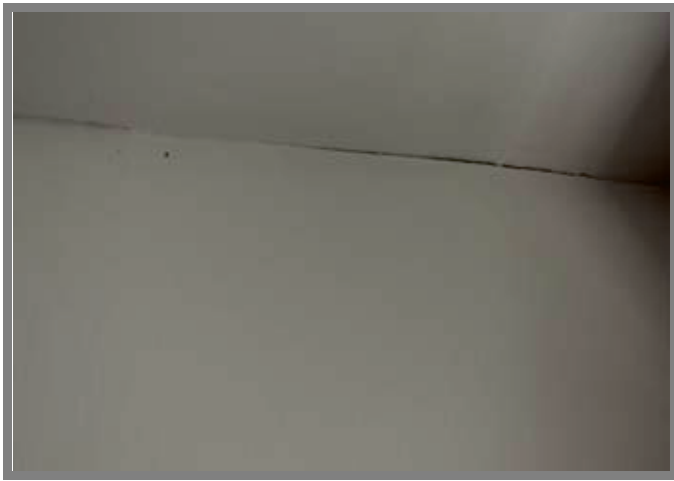
Figure 4. Cracking on ceilings

In Figure 4, the cracks occurred between the wall and the ceiling. Hairlines cracks also occurred on the surface of the ceiling. The probable cause of this crack was vibration and poor workmanship. According to the data analysis from the questionnaire, about 52% of the respondents renovated their own houses. This renovation probably contributed to the causes of the cracking. Vibration, quality of workmanship, and loading change, all occurred when renovation took place. Besides that, the cause of cracking was also a probable factor of subsoil and foundation movement.