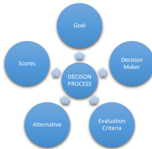
Fig. 1. Elements of a decision-making model

Any decision problem to be solved makes use of decision support, i.e. evaluation techniques.