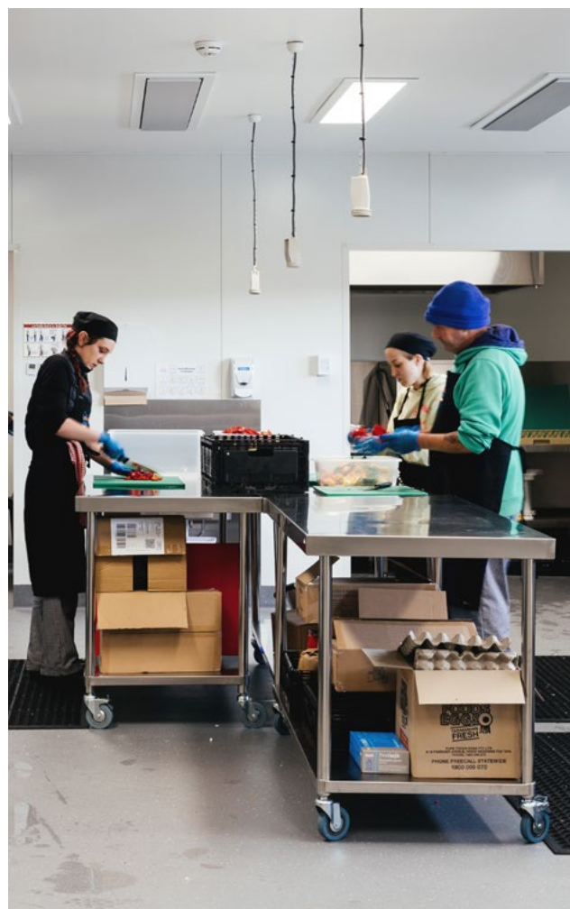
Community training at Eveline House Youth Foyer in Devonport, constructed under Action Plan 1

Action I3.4 Work with Anglicare Tasmania to transition Tasmania's three current youth supported accommodation facilities into Education First Youth Foyers based on 'advantage-thinking' models of best practice.