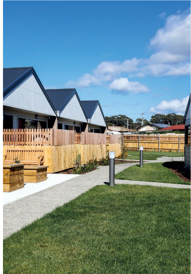
New disability units at Devonport constructed under Action Plan 1

In developing Action Plan 2, stakeholders agreed that whilst market conditions had changed significantly, the broad three key drivers of the Strategy remain relevant. Roundtables participants agreed that the Government's focus must remain on its primary role to increase the supply of social housing and supported