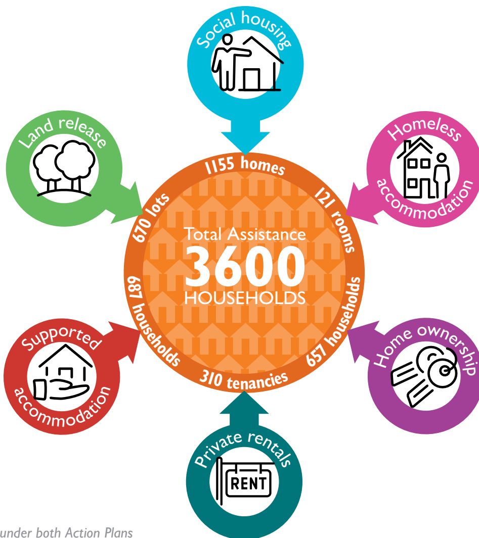
Total assistance under both Action Plans

Below sets out our overall targets for the Strategy under the two current Action Plans.