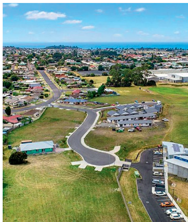
Land release at Devonport under Action Plan 1

Action 2.2 Planning mechanisms will be reviewed to promote a greater array of housing options in new developments, including affordable housing, to determine those best suited to the specific Tasmanian regulatory, social and economic context.