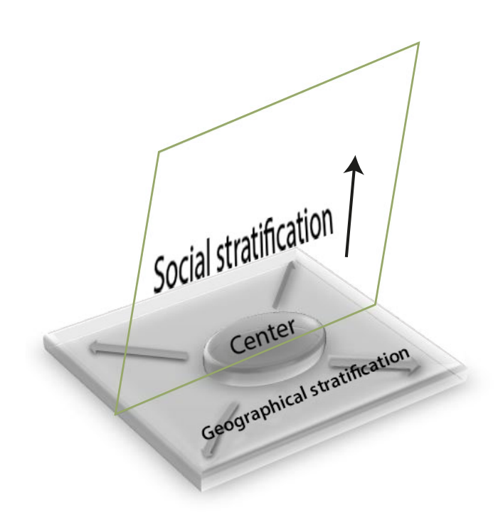
Figure 1. The structure of the 3-dimensional model of academic stratification