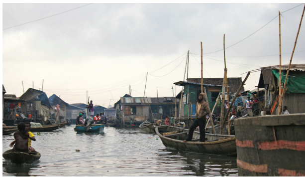
Figure 3. Makoko, a slum with part of its community built on stilts along the Lagos lagoon. Picture credit: CNN [10].

With increased and ongoing influx of people into the cities, there is a consequent increase in household waste. Most landfills, which are not located within the urban core but in and around the squatter settlements, are completely full and overflowing to the surrounding areas with open decomposition of wastes. This leads to the outbreaks of diseases, festered by insects and rodents like houseflies, rats, and cockroaches, which in turn take a negative toll on the swamp dwellers. In addition, there are inadequate sewage facilities in areas of unchecked rapid growth of slums and squatter settlements which are unlawfully developed by the urban