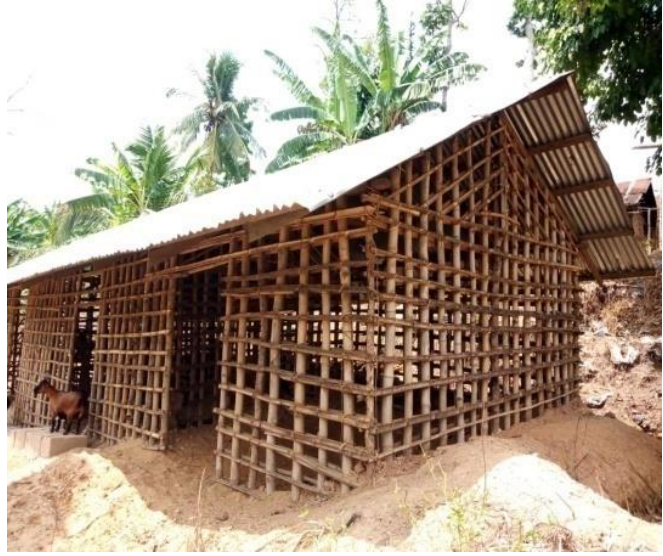
Fig. 1: Building walls constructed with bamboo

The construction of the entire walls of the bamboo building requires infill between vertical bamboo columns or framing members to complete the walling (Figure 1). The infill usually take the two forms namely (i) Whole or halved bamboo culms which are used vertically by driving it directly into the ground or fixed back to the beams by tying with ropes and horizontally anchored to the beams by nailing or tying too. (ii) Split or flattened bamboo which can be attached vertically to in-between the bamboo columns by tying it or mortised into the posts, and also fixed horizontally directly to the posts.