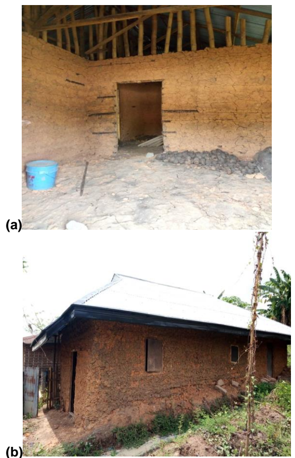
Figure 2a and b: Bamboo buildings finished with rammed mud mortar

In addition to the construction of bamboo walls above, the developers proceed to further strengthen and protect the building from external environmental forces by introducing the use of stabilized or rammed mud mortar to plaster the bamboo infill in and out to give the building an aesthetic appeal (Figure 2a and 2b). The use of mud mortar plaster is determined by the purpose the bamboo building is to serve. This marks the final stage of the bamboo wall construction as it concern the low-income group in the study area in their quest to finding solutions to the housing problem.