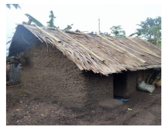
Fig. 3a: Thatch roof on bamboo house