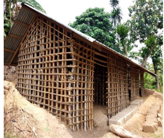
Fig. 3b: Corrugated Zinc roof on bamboo house