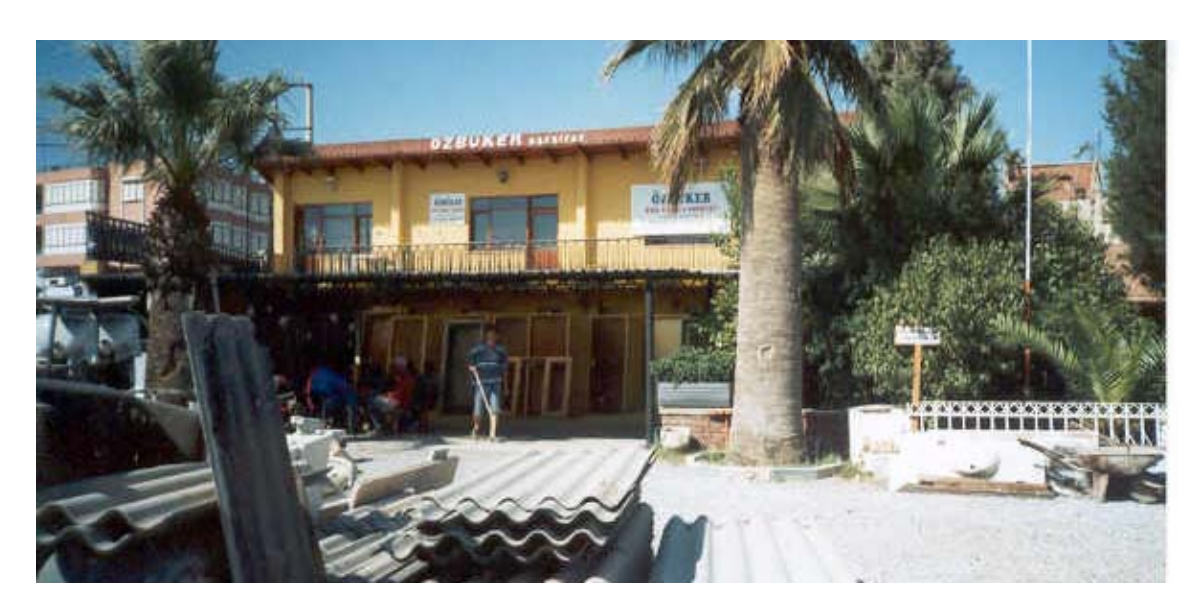
Figure 4. Front view of the double storied office building in the demolition contractor's yard in Buca.

2.2.2 Case Study in Buca . The case study was conducted on a small office building, which belongs to a leading demolition contractor of Izmir and is part of the facilities present at the contractor's yard in Buca, near Izmir. All the three buildings, two workshops and the three sheds at the yard were built from UBM that the owners had salvaged from demolition and renovation projects. The small double storied office building, which was the most recent addition, was surveyed in detail and as can be seen from Figure 4 below, it did not lack in quality or style just because it was a low-cost construction using salvaged material. Although no records were kept about the amount or type of UBM used for the construction, their cost and the number of worker employed, an educated guess could be made from the measured building. The concrete and masonry work was done by hired labour but the carpenters in the employ of the contractor did the finishing work.