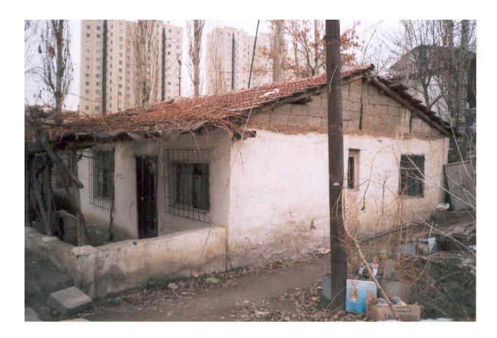
Figure 1. A squatter house in Ankara, built with salvaged material, mismatched windows and iron grills.