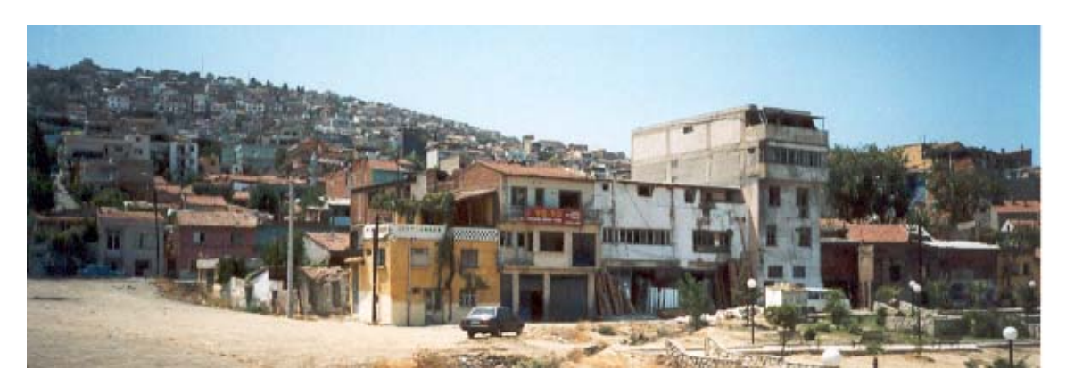
Figure 8. Low cost buildings showing evidence of incremental construction, with squatter housing in the background, in Izmir.

the need arose, or when there were enough funds to meet the cost of additional space. Whether the buildings consisted of one storey or more, it was possible to observe the different stages of construction from their exteriors, as they presented a haphazard configuration of elevations as well as a potpourri of styles, shapes, sizes, material and quality. Moreover, the locations of openings at all floors appear to be at random, which is an indication of an organic expansion of the building (Figure 8).