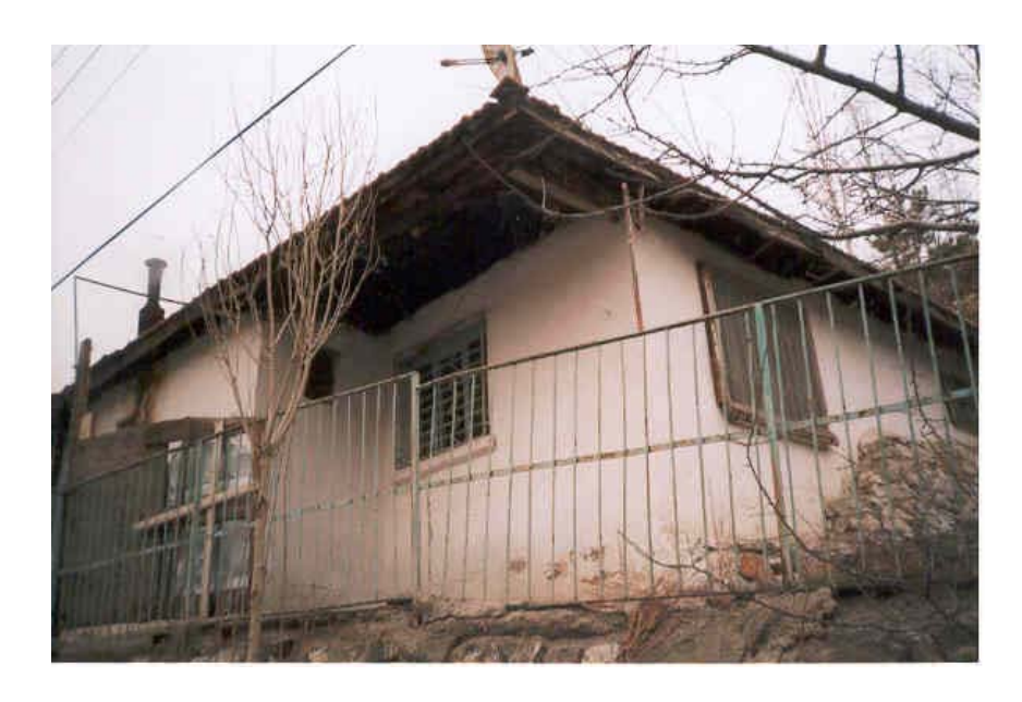
Figure 3. A squatter house in Ankara: the iron-grills are rotated to fit the windows.

2.2.2 Case Study in Buca . The case study was conducted on a small office building, which belongs to a leading demolition contractor of Izmir and is part of the facilities present at the contractor's yard in Buca, near Izmir. All the three buildings, two workshops and the three sheds at the yard were built from UBM that the owners had salvaged from demolition and renovation projects. The small double storied office building, which was the most recent addition, was surveyed in detail and as can be seen from Figure 4 below, it did not lack in quality or style just because it was a low-cost construction using salvaged material. Although no records were kept about the amount or type of UBM used for the construction, their cost and the number of worker employed, an educated guess could be made from the measured building. The concrete and masonry work was done by hired labour but the carpenters in the employ of the contractor did the finishing work.