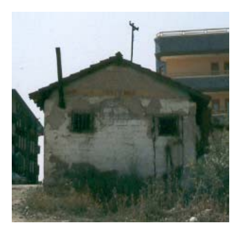
Figure 2. A squatter house in Ankara, built with salvaged concrete blocks that still have bits of old plaster and paint sticking on them.