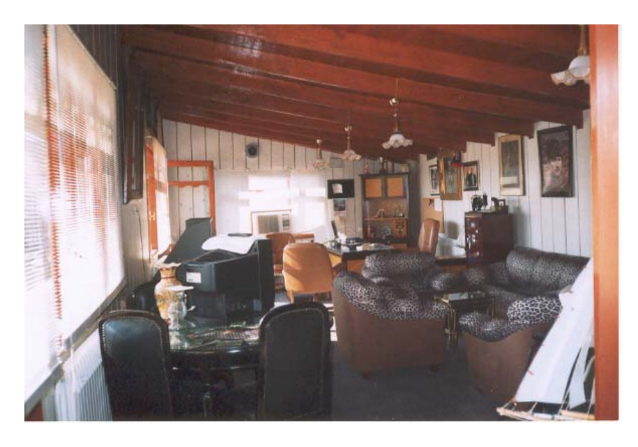
Figure 6. Interior view of the office building at the demolition contractor's yard in Buca.