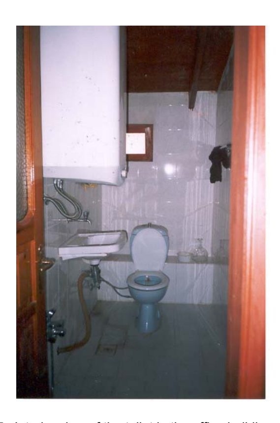
Figure 7. Interior view of the toilet in the office buildings in Buca.