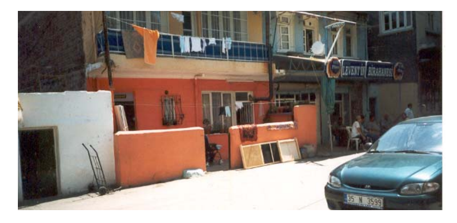
Figure 9. Low-cost buildings in Izmir, built with used building components.

It was also apparent that buildings were constructed not according to a pre-determined plan or design, but in abeyance to the constraints set by the types and sizes of UBM the owners could afford to buy. The reason that the parapet or lintel heights were not consistent and the openings did not align horizontally or vertically was probably that matching fenestration could not be found at the DCY. By and large, utility and affordability took precedence over aesthetics or even comfort in squatter housing. However, in some low-cost housing examples in Izmir, a concern for visual harmony was witnessed (Figure 9).