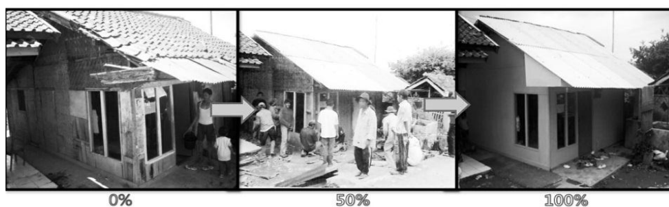
Figure 1. The progress of home improvement is not habitable (Rutilahu)