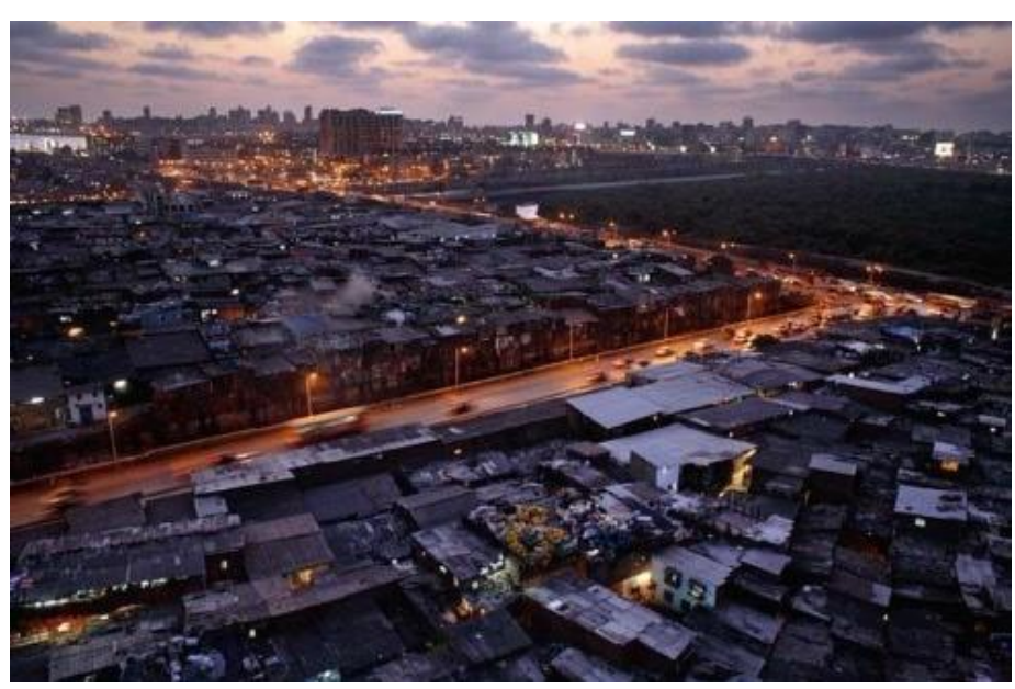
Figure 2 Dharavi

Attracting a significant number of Dalit, untouchables (due to the fact that they could live a better life with more freedom here than in their places of origin), Dharavi started to grow, as well as Mumbai started to sprawl its borders towards north. Becoming a modern city with appropriate infrastructure investments, housing, commercial and industrial units constituted an attraction point for migrants throughout the country.