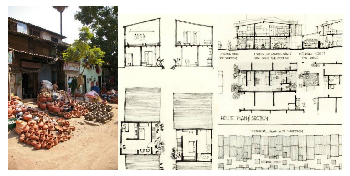
Figure 3 Dharavi: Commercial activities at street level

The urban pattern and the spatial organization of Dharavi has a tight relationship with the activities of its people. Considering the inhabitants being involved in day-long economic activities and the needs of storage of raw materials, distribution and organisation of the goods as well as the climate factors (monsoons, excess heat) are translated into current architectural language of the buildings within area. The integration of this 'grey' economic activities with the partially informal means of residences makes Dharavi attractive for even world-wide famous designers, coming to the district to get their designs produced cheap and high quality.