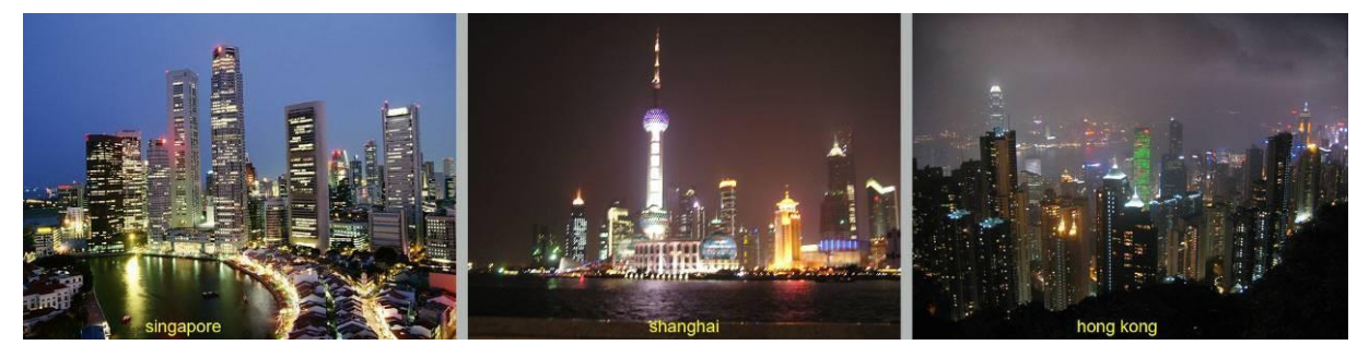
Figure 1 Cityscape Singapore, Shanghai and Hong Kong

For a better understanding of urban mixite in a certain geography with its distinct cultural heritage, it is important to get back to vernacular and grass root settlements. Such settlements were developed by and for people living in it. Such a perspective might be seen romantic and lead towards preserving parts of a city, often only for tourism and their perception.