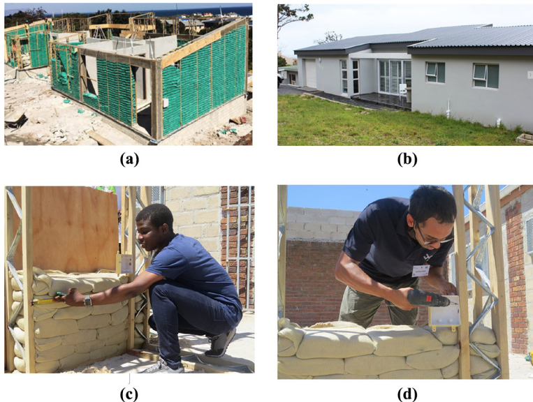
Figure 1. Houses constructed using sandbag technologies in South Africa

This research adopted a qualitative approach that used focus group meetings as the primary data collection method for this study. Qualitative research has been identified as an effective approach in addressing the social perception in housing-related research (Nadal et al. , 2018). The two primary methods of data collection used in qualitative research comprise participant observations: typically, through an interview or in focus groups (Gill et al. , 2008). The focus group can capture actors' perceptions towards gaining an in-depth understanding of the social issue (Nyumba et al. , 2018). This speaks to the objective of this study, which seeks the perception of the stakeholders on the use of ABT in housing delivery. The respondent can share ideas on a particular problem through a focus group discussion and inform future decision-making and strategies (Nyumba et al. , 2018). When conducting complex research requiring deep understanding, focus group methods will enable the researcher to generate rich and detailed data (Man et al. , 2017).