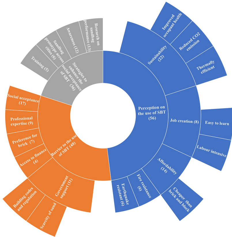
Figure 2. NVivo Sunburst diagram of the perception

They are a fantastic alternative to traditional building techniques. The concrete used in a sandbag house (columns and lintels) accounts for around 50% of its carbon footprint, and low-carbon concretes or alternative materials may greatly lower the carbon footprint of sandbag construction. (Participant D2)