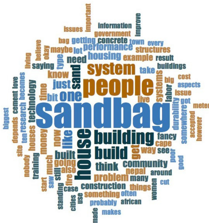
Figure 3. NVivo word frequency analysis

alternative solutions to resolving the ever-increasing housing problem in South Africa because of their affordability (cheap and affordable):