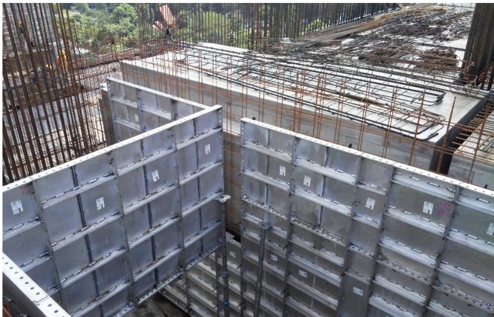
Diagram 2: Engineered formwork system made of aluminium

Such alternate formwork systems are of two types – engineered formwork systems and stay-in-place formwork systems. In engineered formwork systems, the formwork is dismantled once the concrete is set. Engineered formworks are made of aluminium, plastic or other composites (Diagram 2). They can be used for 300 to 500 repetitions and can be used for low-rise as well as high-rise structures (Building Materials and Technology Promotion Council, 2018). Stay-in-place formworks are suitable for low rise and mid-rise buildings. In a stay-in-place formwork system, the formwork is left within the concrete and thus becomes a part of the building. Engineered formwork and stay-in-place formwork is manufactured in factories by firms specialising in the manufacture of these alternate formwork systems and are made to order. In most cases, these alternate formworks are imported from outside India, where they are designed and manufactured exclusively for the project.