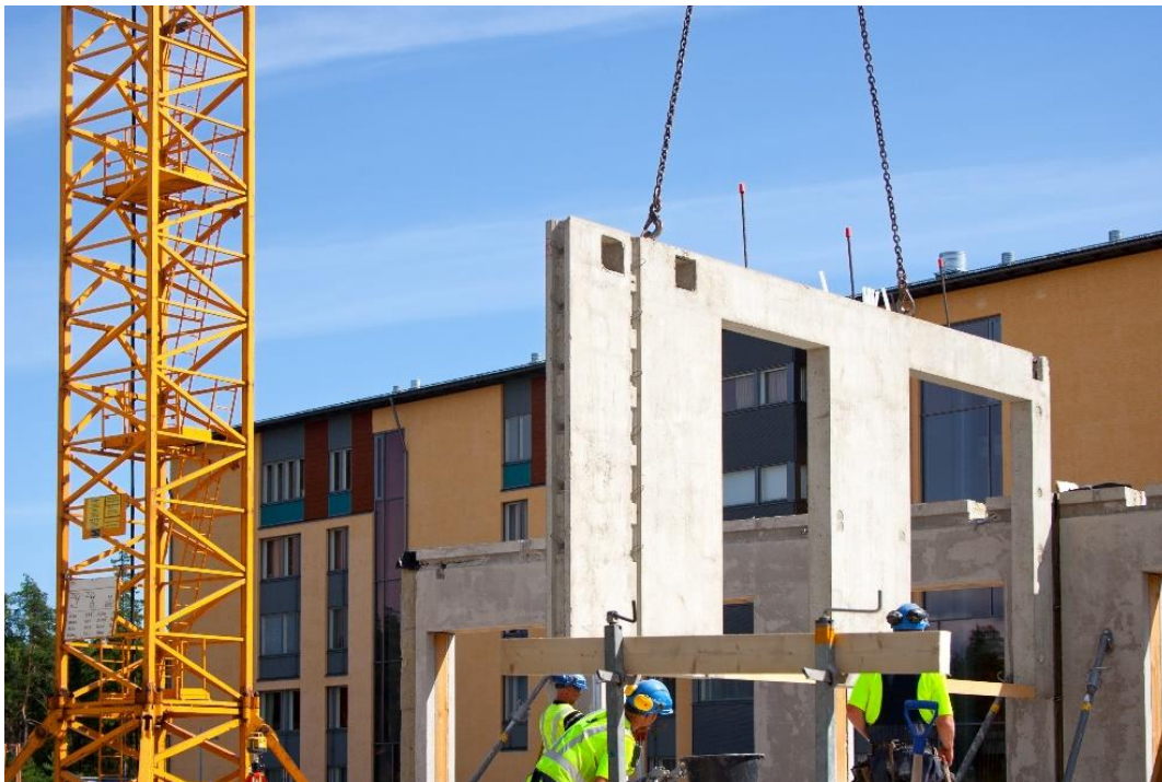
Diagram 4: Precast wall panel

Precast technologies involve the manufacture of various components of the superstructure of the building in an offsite plant and assembling these components on site. Columns, beams, slabs, walls, stairs, and even entire rooms are manufactured in an offsite plant, transported to the site and assembled to form the superstructure (Diagram 4). The precast components are assembled with the help of cranes and other machinery, and joined together using joinery elements like splices, billets, bolts and inserts of different shapes and sizes depending on structural design requirements. The kind of cranes and other machinery required on site depends on the volume, the size of the precast components and the height of the building. Once assembled and joined together, the building only requires finishing work in terms of electrical work, plumbing work, flooring, painting and other internal and external finishes. Precast technologies involve moving a significant proportion of the construction process offsite to a factory-controlled environment.