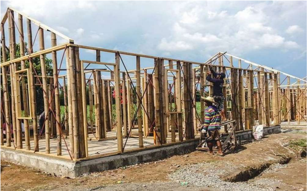
Base Bahay Foundation Inc.'s Cement Bamboo Frame Technology is a prefabricate bamboo building system designed to be earthquake resistant

are sourced from responsibly managed forests and 90% recycled materials, such as PE plastic and wood. 9 Builders and developers are also initiating steps to increase affordability by designing housing units more efficiently, including modular housing assembly solutions which can cut construction times by at least 40%. 10 An example of this in the Philippines is CUBO Modular Inc., a startup using engineered bamboo panels in modular home construction projects.