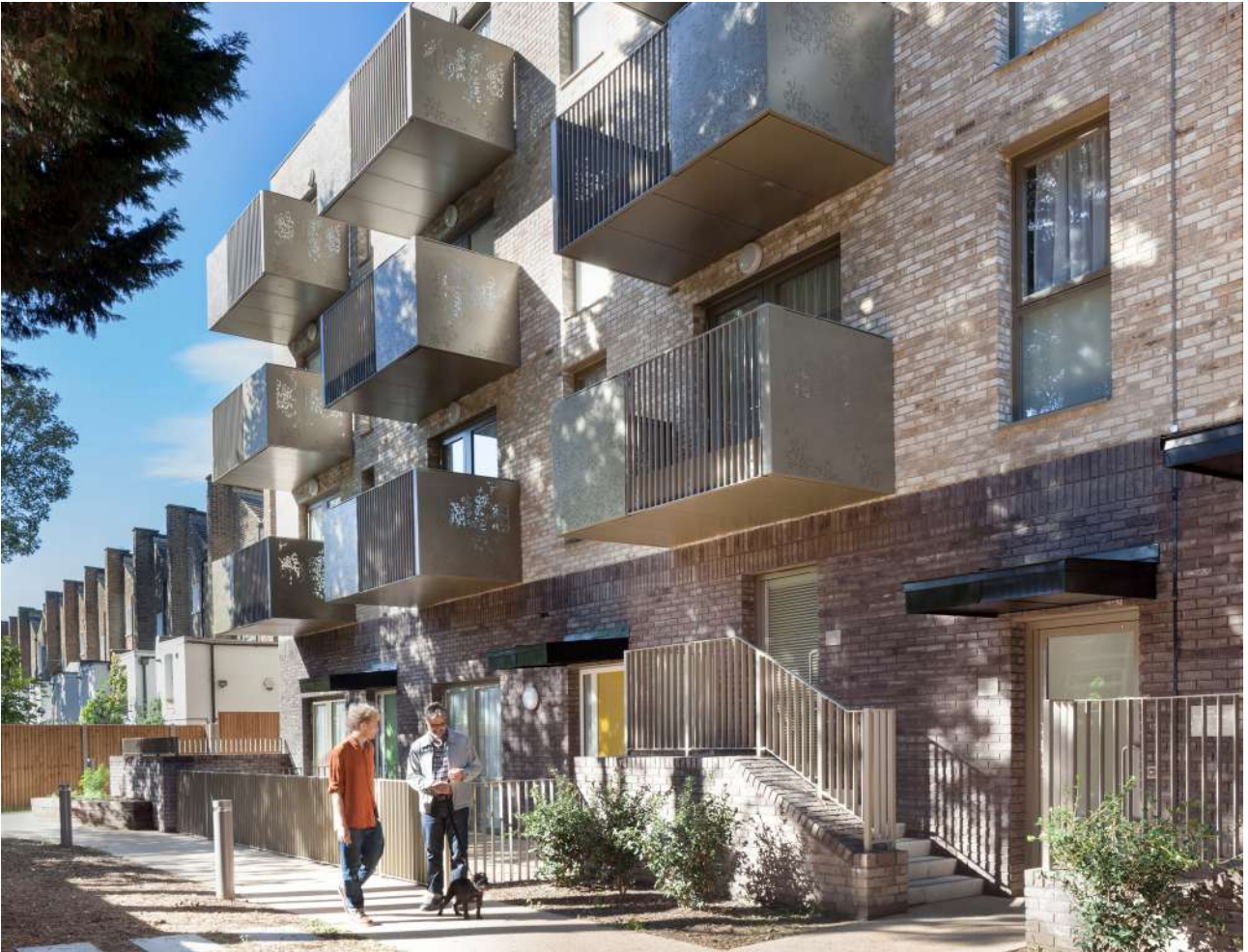
Dover Court Estate, LB Islington.

London has been in the midst of an affordable housing crisis for decades.