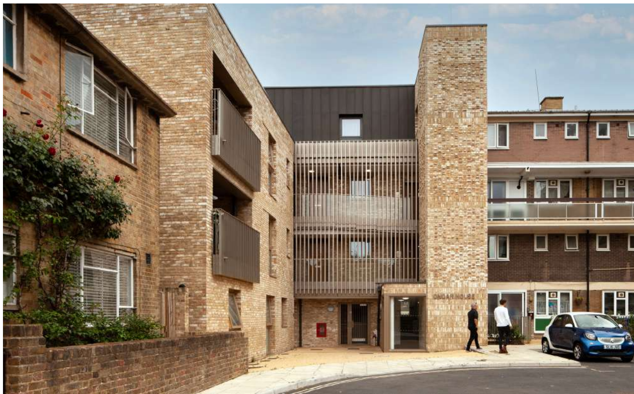
Dover Court Estate. Credit: Pollard Thomas Edwards.

There is a 'mews' terrace between Dove Road and Balls Pond Road that animates the ground floor