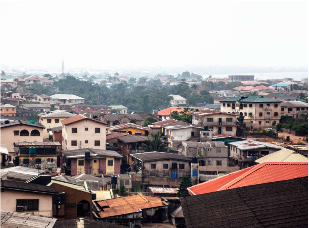
Lagos, Nigeria.

Currently, 66% of the city live in informal settlements and housing supply