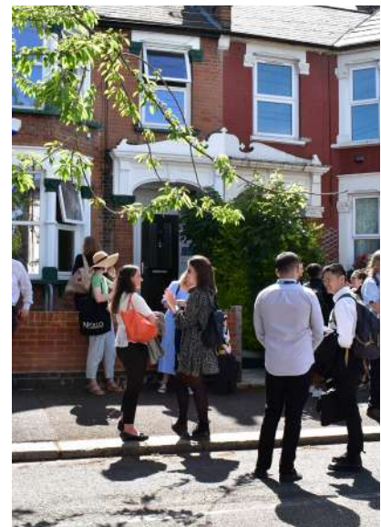
Eco show home in Waltham Forest

According to the UK Green Building Council (UKGBC), 80% of the UK homes that will exist in 2050 have already been built . As our homes currently account for around 15% of its green-house gas emissions ,