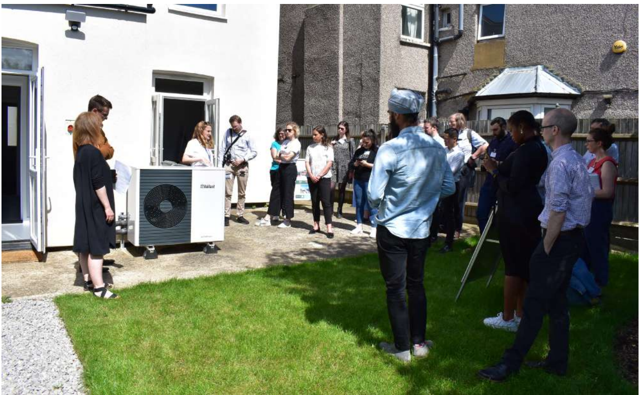
Learning about the heat pump during Fol's May 2022 field trip to the Eco Show Home, LB Waltham Forest.

Although almost every London council is now directly engaged in social house building, and starts and completions for social rent homes in London have risen sharply since the Mayor of London's Affordable Homes