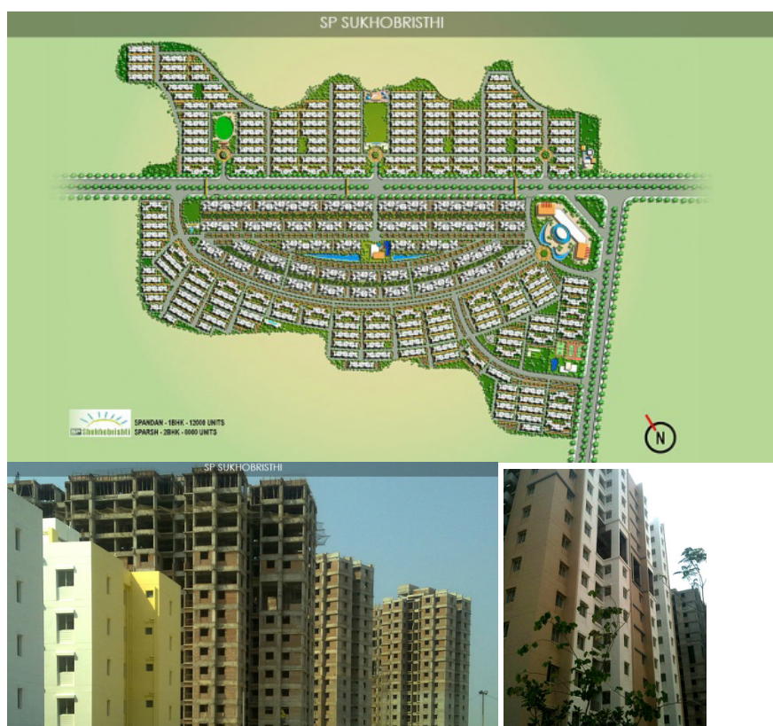
Figure 2 Sukhobristhi Master Plan and building features

flagship public-private partnership project but also because it signifies neoliberal interpretation of mass housing for the urban poor. As a partnership project, it seeks to satisfy both public and private goals. The strategy adopted was to roll out a replicable, contemporary design of homes that is affordable and of acceptable quality. Homes are sold at levels nearly half of market rates, and strikingly, on freehold basis without any restrictive covenants on the titles, or restriction to maintain affordability to perpetuity. As a result, homes are now available in the second hand market at approximately double the original price. Developed by the group which has constructed higher-end housing such as the 60 stories Imperial Towers in Mumbai – India’s tallest residential towers to date, Sukhobristhi has the hallmark of lifestyle logic flowing from luxurious apartments offered at unbelievably low price tag. The following sections examine key features and the extent to which these suggest the emergence of new affordable housing paradigm.