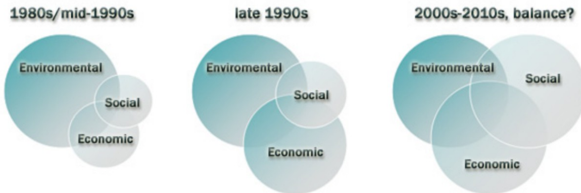
Figure 2: The Changes of balance on three main factors of sustainability since 1980s till 2010s in the world [15, p. 44]

Furthermore, sustainable development is not intrinsically the only a valuable issue, but it can also serve as excellent vehicles for launching a broader community conversation about economical, environmental, and social matters in general [12]. Significantly, the general definition of sustainability emphasizes that economical, ecological and social aspects are supposed to be given equal weight. Considering their application that is still not the case. As shown in Figure 2, the efforts have been made to bring the other two aspects back into balance, but these attempts have not yet been successfully happened in the reality [16].