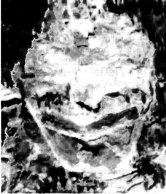
Imagen No. 2.

The community started to organize themselves to provide open rain systems and a sewage collector. They acquired illegal connections from the city's power and water system which was provided to the formal high-income neighborhoods surrounding them. The land was occupied according to the families' needs. The houses were built incrementally and were allocated according to the topographic characteristics of the terrain. Some of the Juan XXIII male population worked in the construction sector, and they acquired some of the modern skills to build their own houses with better materials