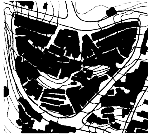
Imagen No. 4.

The experience of the Juan XXIII epitomizes the struggle of poor population to attain affordable housing. Even if those environments are precarious it is possible to improve their qualities to make them more livable. Following the policies of the POT, the Bogotá's Mayor Office has contemplated two programs to raise the quality of life of squatter settlements and illegal subdivisions. First, the "Demarginalization" program (1998-2001) which focused in "normalize the urban conditions of marginal neighborhoods, to finance the infrastructure networks, to promote projects that stimulate city usage and to resettle families that lived in high risk zones." Second, the "Integral Improvement of Neighbourhoods" program which focus in enhancing the social and participative nature of illegal neighborhoods. 32