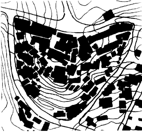
Imagen No. 3.

time the neighborhood enjoyed informal security of tenure status and the population affected was relocated near the neighborhood. After five years, a non profit organization provided prefabricated houses to those families in the very place of the disaster. Curiously, these new one-storey houses (the only ones that were not produced by self help processes) have not been enlarged or upgraded since then. Analyzing the neighborhood's morphology, it is evident that the inner public spaces are an unplanned outcome in has prevailed. Currently, the Juan