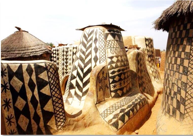
Photograph 5 Traditional mud houses in Burkina Faso.

In recent decades, earth houses have transitioned from subterranean or earth-blanketed structures to construction with earth blocks. This process is faster for construction and requires less maintenance for prevention of moisture penetration. Typically, mud, adobe or earthen blocks are formed, as the basic building block. Where clay content of natural soil is low, additives can be added to enhance workability and durability. One particularly successful method is the Interlocking Hollow Compressed Stabilized Earth Brick (CSEB), discussed in further detail below. Compressed earth blocks require just over 10% of energy needed to produce the same weight in common fired clay bricks (Waziri, Lawan and Mala 2013). Stabilizing of earth blocks can be done with lime instead of cement to achieve comparable strength to concrete blocks. The stabilizer also helps earth blocks to withstand humid environments. Throughout the production and construction process, there is substantial opportunity for training and engaging local labor and businesses.