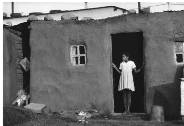
Photograph 1 Child in her earthen house.

pressure on the material supply chain, avoiding the increased material costs from growing global demand while reducing transport-related GHG emissions. At the same time, it also provides opportunities for local economic development. This study takes a life cycle