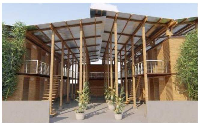
Photograph 3 CUBO: eco-friendly bamboo house, winner of 2018 RICS competition.

Companies specializing in building with bamboo and bamboo laminates are increasing in popularity. Building with bamboo is also changing from high-end products such as eco-resorts and ceremonial halls to the vernacular, such as schools, shelters and bridges. Due to regulatory lags, and to lack of familiarity among builders and customers, using bamboo for housing has yet to take off at scale.