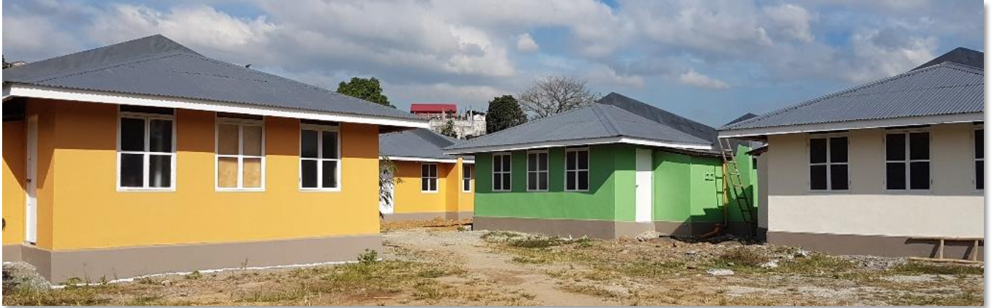
Photograph 11 CBF homes built by Base Bahay in the Bagong Silangan Kawayan Housing Initiative.