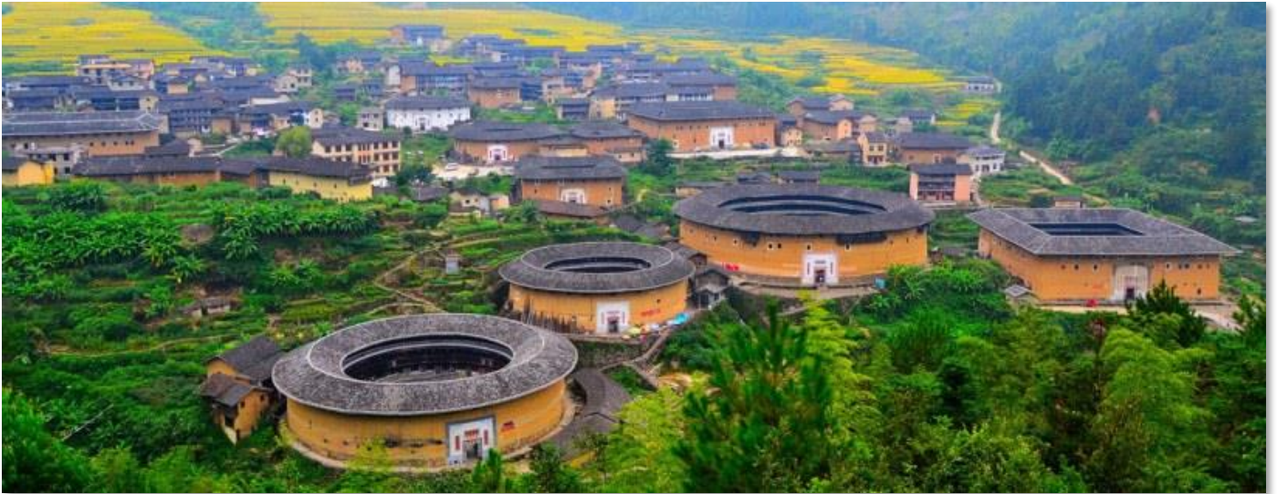
Photograph 12 Fujian Tulou, a UNESCO World Heritage site. Communal buildings are constructed with a mixture of earth, wood, stone and bamboo.