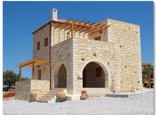
Photograph 6 Stone house in Greece.

Stone has a long history of use as a structural element for homes, religious temples and monuments, with the Egyptian pyramids being the most elaborate demonstration of ancient stone structures. In dry and hot climates, stone provides heavy thermal mass that helps to keep building interiors comfortable. This makes it an attractive low-carbon building material if there is a local source.