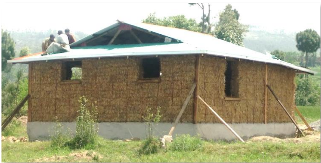
Photograph 4 Construction of straw bale house in rural Pakistan.

Where straw is readily available as a waste product, the costs savings in material production and transportation can be substantial. Diverting straw from the waste stream further stimulates local economy through value creation from waste. As straw needs to be kept dry to prevent deterioration of the material, it may not be suitable in places with high humidity. However, regulatory lag and the wider land area needed for straw bale walls make this an unlikely material to be adopted on a large scale for urban housing. Rather, structural straw panels and insulation blocks are likely to enter the materials market to provide a cost-effective alternative to concrete and brick walls.