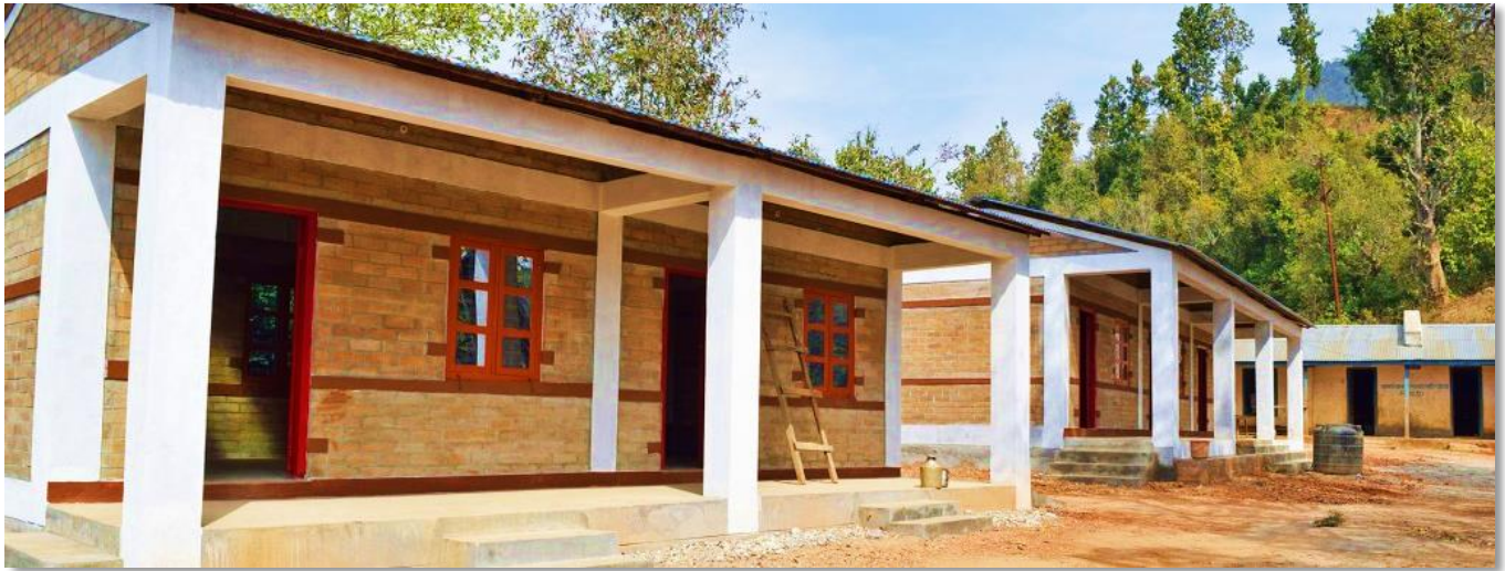
Photograph 10 Classrooms built with CSEB.