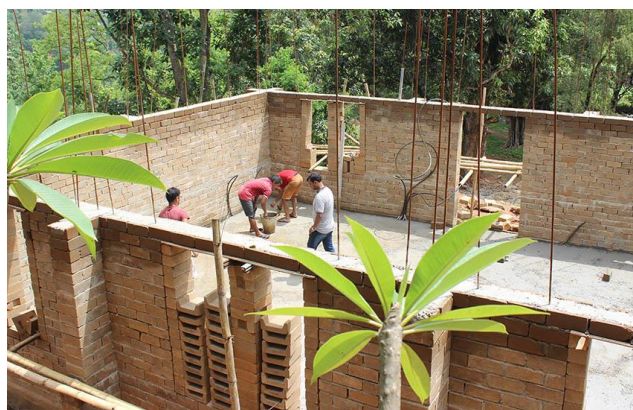
Photograph 9 House construction using CSEB.

rural Nepal using interlocking CSEBs and training local groups and companies to manufacture and construct with CSEBs. Through these projects, Build Up Nepal sought to empower local entrepreneurs with equipment and skills while providing rural communities with affordable and earthquake-resistant homes. Working across the supply chain, the NGO supports local micro and SMEs to promote sustainable and affordable construction materials. CSEB houses are built with local materials and are sustainable, safe and affordable. The use of CSEB as a housing material is approved by the governments of Nepal, Thailand, India and several others. 11 Build Up Nepal estimates that building 50,000 CSEB houses with their design, 495,000 tons of CO 2 will be saved as compared with building with bricks, as is common in Nepal.