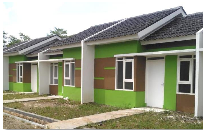
Photograph 2 Low cost housing development in Indonesia, Puri Harmoni 9.

Wood has been used for housing across many countries and cultures for centuries. In recent decades, there is renewed interest in wooden buildings, for their aesthetics, lower cost, shorter construction periods and lower environmental footprint. The Food and Agriculture Organization of the United Nations estimates that approximately 1,330Mm 3 of roundwood is harvested annually for building and construction, with use of wood-based panels and composites increasing across all regions over the past 5 years (FAOSTAT 2018). New construction methods have enhanced the performance and diversity of timber buildings including multi-storied residential and commercial buildings, though these are mostly in developed countries such as Australia and the United Kingdom. 4