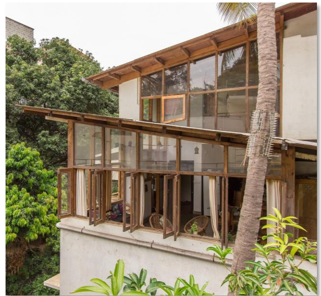
Photograph 8 The Kachra Mane, “Scrap House” in Bangalore, India.

While there is substantial research and experimentation on green concrete, the product remains largely a niche material due to the price and the need for customized engineering (Kamath and Khan 2017).