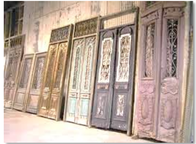
Photograph 7 Resale door frames in a salvage yard.

Reusing building materials is instrumental in reducing the volume of waste produced by the industry while reducing demands on raw materials. There are opportunities for reusing wooden elements such as doors and window frames, floor and wall tiles in new houses. Metal components are easily re-worked and painted for reapplication in a new structure. They can also be smelted and reformed for a completely new structural function. Crushed concrete is often mixed into fresh concrete or asphalt pavements as coarse aggregate to provide bearing strength. However, careful assessment should be made by qualified personnel when reusing materials for structural elements such as beams and columns. Stone waste, fly ash, and similar industrial waste could be used in a concrete mix partly replacing sand, stone and cement components. The reuse of broken bricks, concrete blocks or ceramic tiles for backfilling or compacting applications in the construction site is also viable.