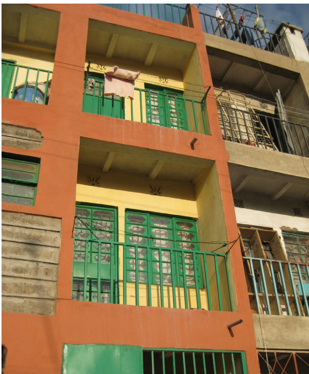
Homes developed by SDI members in Nairobi's Kambi-Moto slum after years of group saving. The community made of 270 families eventually received the land for free from the Nairobi City Council and incrementally constructed multistory homes.