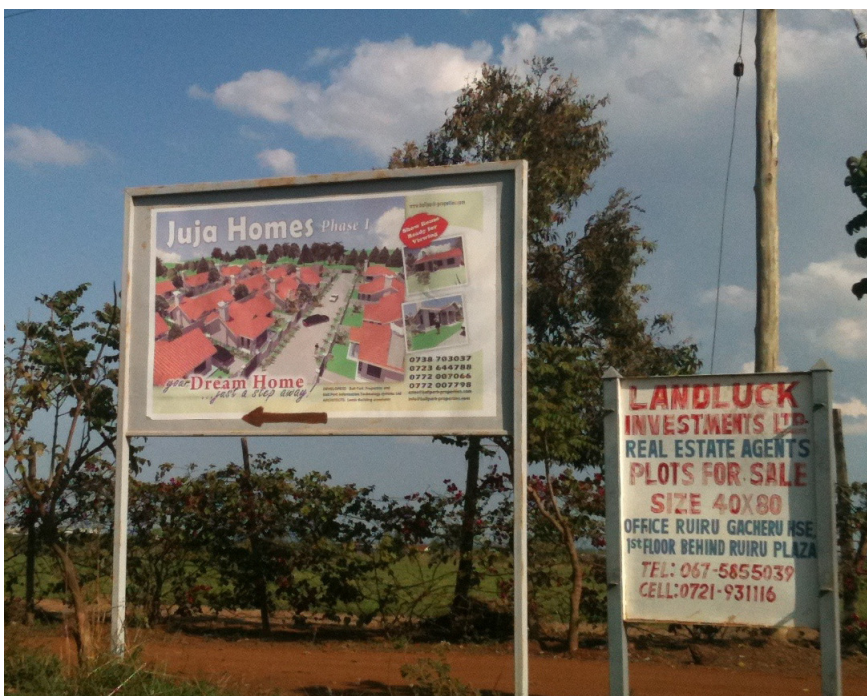
Developments are popping up all over Nairobi, including on the outskirts of the city, and land is sold at rapidly increasing prices.

i. Land as equity: Find a land partner who can come in with the land as equity. This means eventually paying for the land in the form of dividends, which may align nicely with cash flows since revenue comes in first and the whole payment does not need to be made at once.