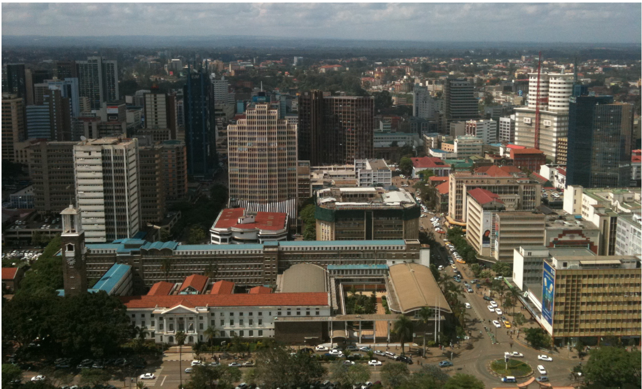
Nairobi skyline. The city is rapidly growing and unable to meet a growing demand for housing.

There are many avenues through which to address these dynamics, whether it is housing supply, end-user finance, or new technologies. Each has its own unique challenges and opportunities; each warrants a document of its own. In this particular report we choose to focus on housing supply in urban Kenya. We attempt to paint a picture of the landscape and offer some strategies for success.