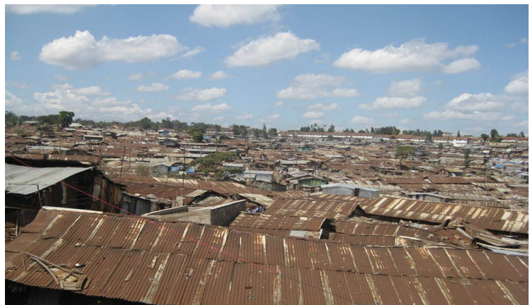
Sixty percent of urban Kenyans live in sprawling slums such as this

Kenya's housing challenge is extreme. The average price for an apartment in the capital city of Nairobi is currently KES 11.58M (USD 136,000), up from KES 5.2M (USD 61,000) in December 2000. 5 There is no home on the formal market below KES 2M (USD 23,000), a level that is still completely unaffordable to low-income populations. As displayed in the graph below, property prices in Kenya continue to rise at a rapid rate. According to real estate and property experts Hass Consult, this trend is likely to continue, “With few mortgage owners, and ongoing economic growth, we see no prospect for a collapse in housing prices. Kenya isn't yet oversupplied with housing.” As a result, 60 percent of urban residents live in slums. And this is just the supply side.