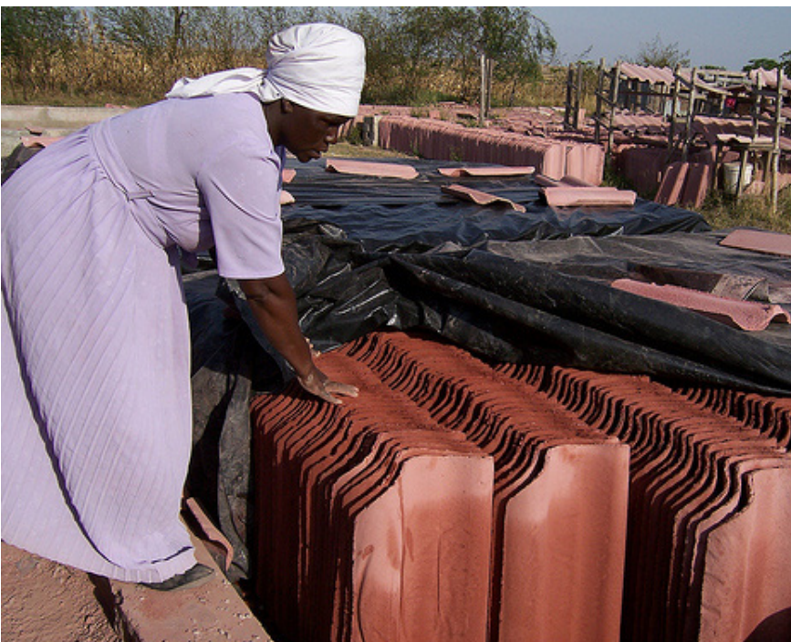
Jamii Bora manufactures their materials on site at Kaputei Town. Here a worker, who is also a resident of the community, is drying roof tiles made in the factory on-site.

ii. Manufacturing materials on site is another way to reduce costs and also maintain more control over the construction process. This technique may not be appropriate for all developments, but should be considered when possible, especially in a context where materials acquisition can be fraught with delays and supply shortages.