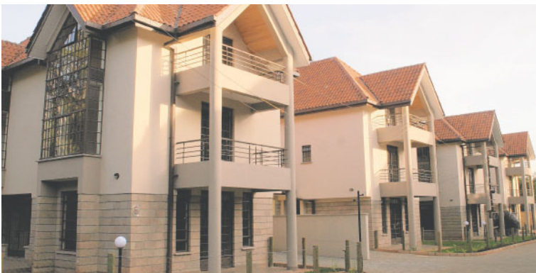
Middle income housing development in the typical style of urban Kenya.

Just because the intention is for low-income buyers to purchase the homes does not make it the case. Speculators and investors are rampant in the Kenyan real estate market—snatching up homes and reselling them at higher prices. This will continue to be true as long as there is a shortage in the market. Therefore, developers wishing to cater to the poor must address this challenge head on or they will not achieve the desired impact.