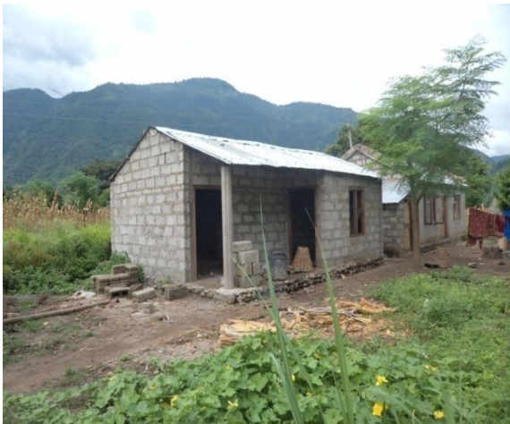
Photo 2: People Housing Program, Chitwan (Shah, S.K., and Mishra, A.K., 2018)