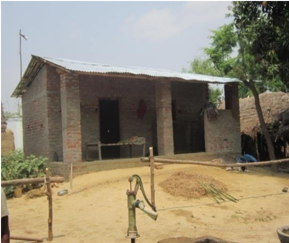
Photo 1: People Housing Program, Rupandehi (Shah, S.K., and Mishra, A.K., 2018)