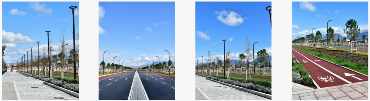
Tirana North Boulevard