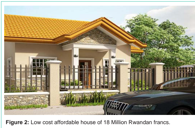
Figure 2: Low cost affordable house of 18 Million Rwandan francs.

housing providers to access lower cost debt for longer terms unlocking desperately needed “fit-for-purpose” funding into the sector in Rwanda.