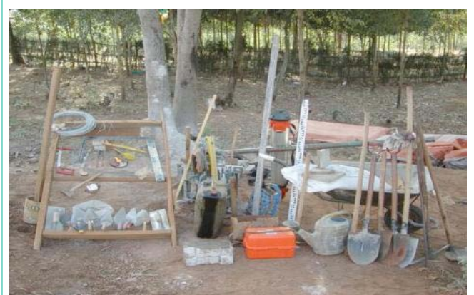
Figure 3: Tools to presses blocks in local raw materials.