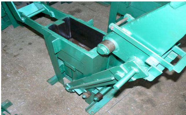
Figure 5: Electrical presses machine.