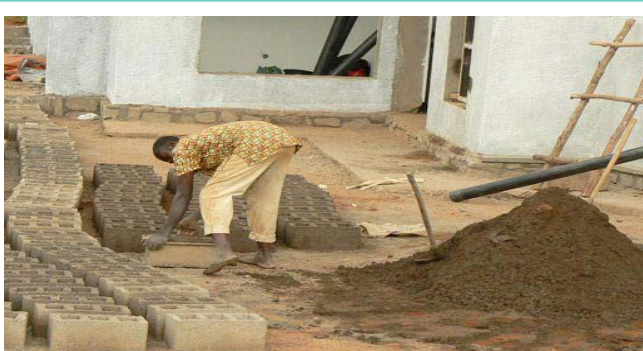
Figure 6: Priced out; the challenges for young professionals.

operated and others are powered with electricity or petroleum (Figures 4 & 5). Manual presses are operated by semi-skilled workers, whereas powered machines need more skilled operators and are more expensive to run.