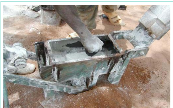
Figure 4: Manual presses machine.

increase affordability while maintaining commercial viability. These strategies are not a formula, but suggested ingredients that we expect will improve the chances of success.