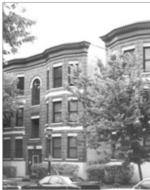
CommonBond's Cathedral Hill apartments.

CommonBond Communities, a nonprofit provider of affordable housing and support services, recently purchased and rehabilitated a complex of seven deteriorating apartment buildings near the St. Paul Cathedral. Before CommonBond's intervention, the buildings were 50 percent vacant and in danger of converting from affordable units under the federal government's Section 8 program to market-rate housing. Many of the nearby buildings had recently converted to upscale apartments and condominiums, and CommonBond pursued the project in part to demonstrate how to successfully maintain and operate low-income housing in such a neighborhood.