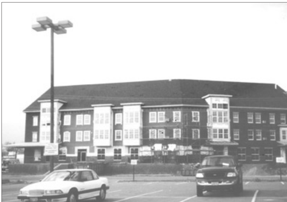
Chaska's brickyard development.

The building will have a mix of office, retail, and apartment space. Renovations have begun, and the HRA expects the project to be completed in early 2001. When completed, the HRA's offices will be located on the first floor, along with 2,200 square feet of retail space. Thirty-two apartments will occupy the upper floors and rent for $510 to $700 per month.