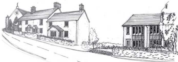
Affordable housing on rural exception sites

On rural exception sites it is essential to use sympathetic forms, massing and scale, incorporate local materials and detailing, and retain existing landscape features and boundaries, to integrate the new into the fabric of the village. This should not prevent innovation, especially where imaginative design is used to improve the energy efficiency and sustainability of the building