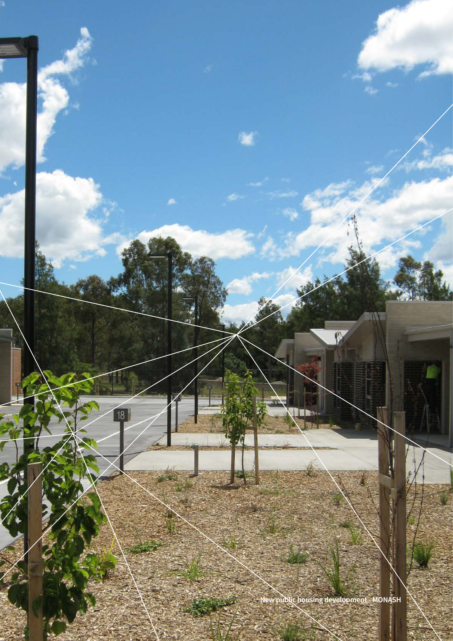
New public housing development - MONASH