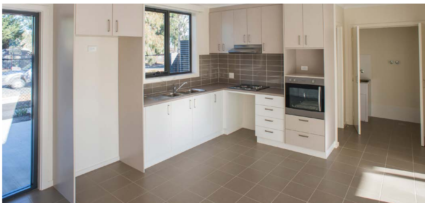
New public housing development, interior

Your ideas about how these costs might be met would be welcomed. What priority do you place on supporting those members of our community that need extra help?