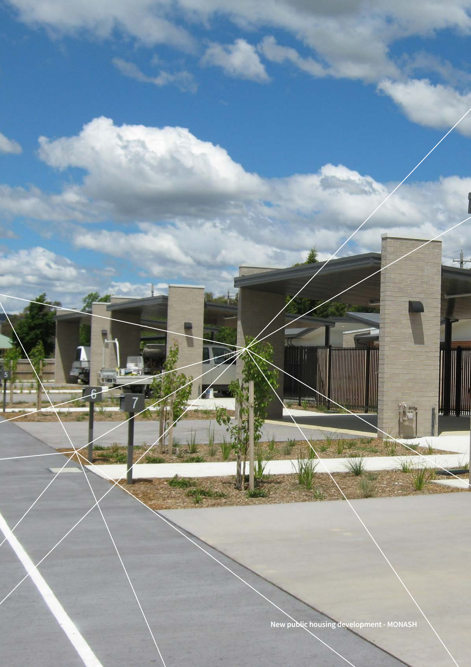
New public housing development - MONASH