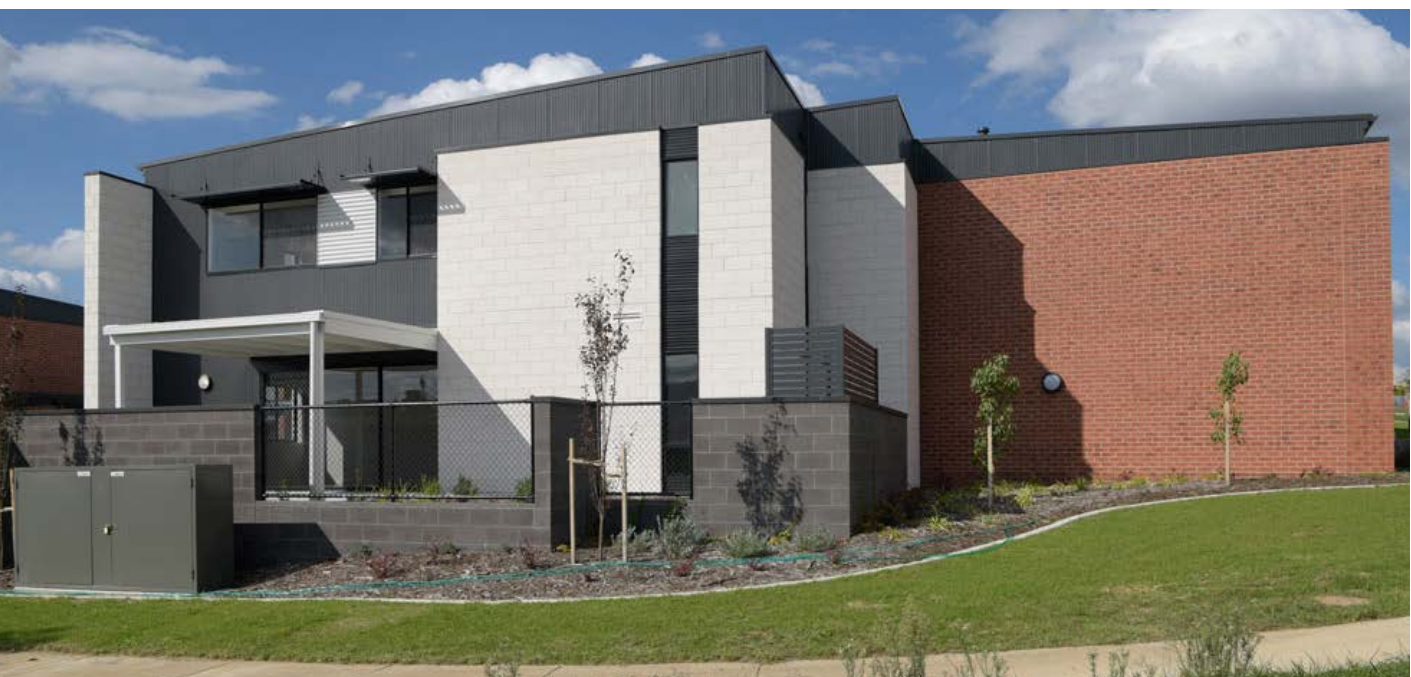
New public housing development - COOMBS

Shared equity models are in place throughout Australia including ‘Shared Home Ownership’ or ‘Keystart’ in Western Australia run through the Housing Authority. A shared equity program is run for public housing tenants in the ACT through the Community Services Directorate. This model is also known as ‘shared appreciation mortgage’. Shared equity has the role of reducing the initial deposit and the ongoing repayment costs.