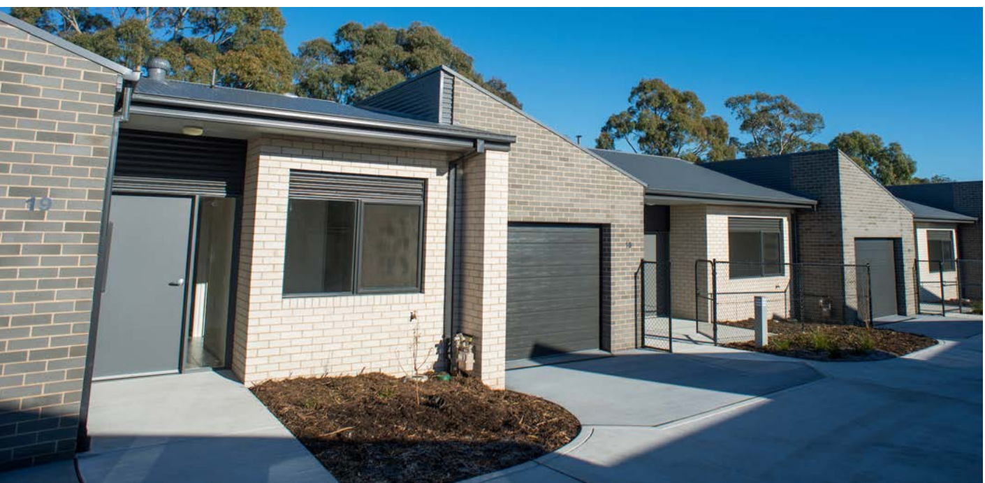
New public housing development - CHISHOLM

Housing ACT has been moving towards a ‘social landlord’ service delivery model through recent reforms called Modernising Tenancy Services. First introduced in 2014, this approach has implemented a targeted, differentiated and outcomes-focused operational model that is aligned with the Government’s human services reform vision of ‘better lives for everyone with better services.’