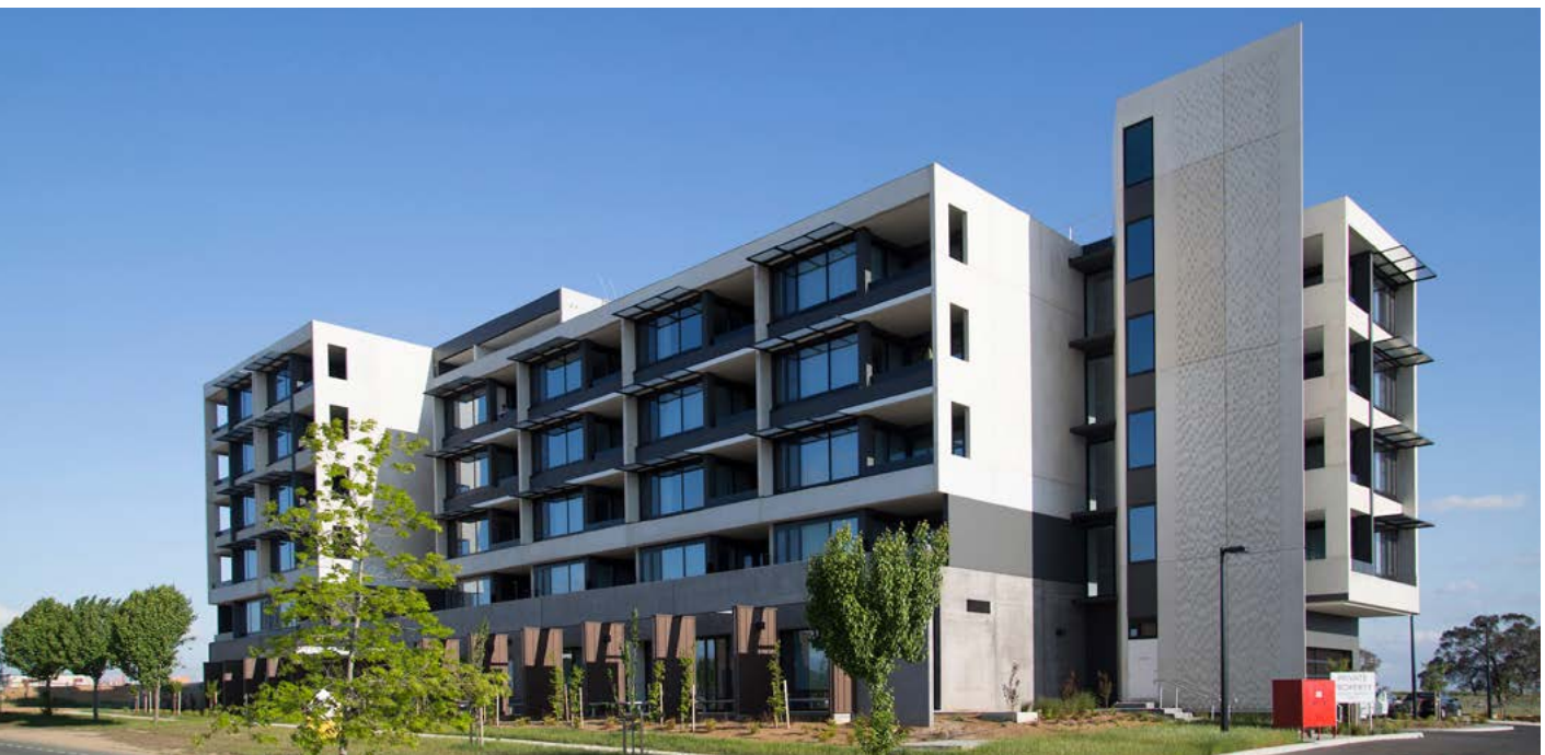
Public housing development, ‘Common Ground’ - GUNGAHLIN

At the 2016 election, the Government committed to reducing homelessness and strengthening the capacity of the specialist homelessness services sector to respond to the Territory’s most vulnerable people. People seeking homelessness support often have high and complex needs requiring a specialist response from skilled practitioners to provide the necessary case management and wrap-around support. There are, however, key groups that may need more support, such as older women, young people leaving care, people sleeping rough, Aboriginal and Torres Strait Islander communities and women and children escaping domestic and family violence.