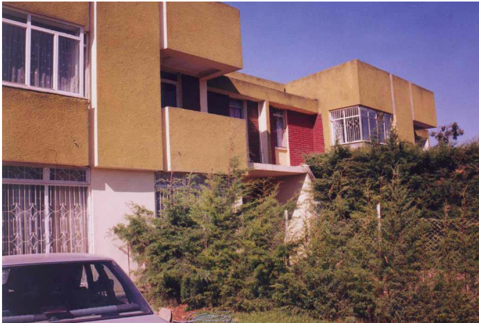
Modification of facade from the original design