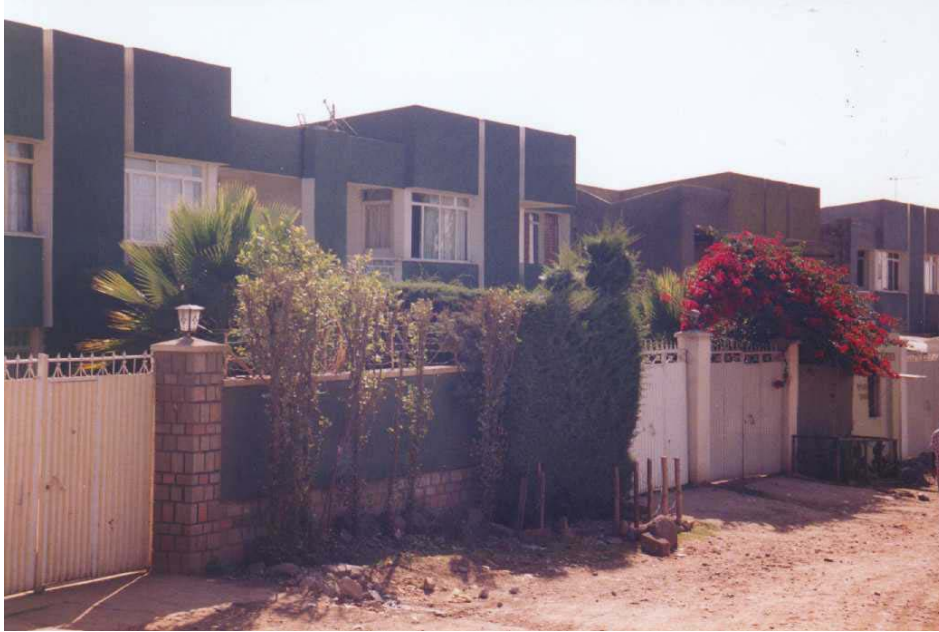
Building project with incomplete infrastructure in Bole Area