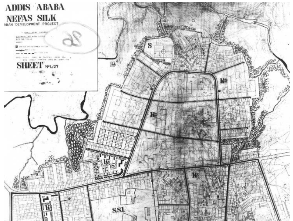
Site Plan of Project-1