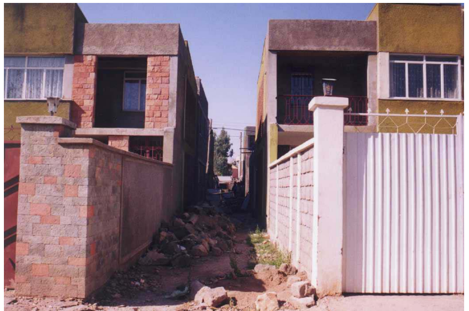
Buildings under construction stage