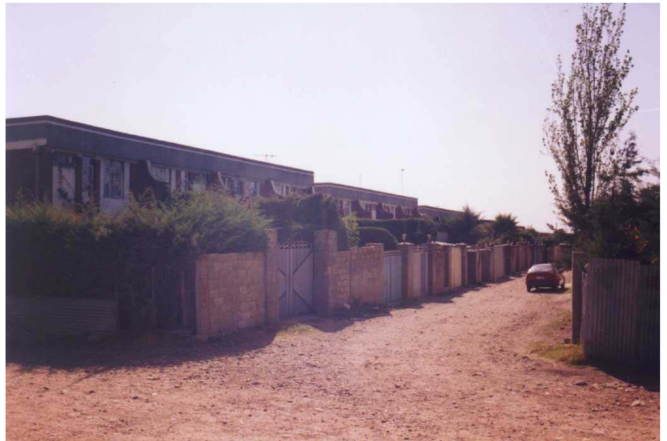
Incomplete road and drainage system