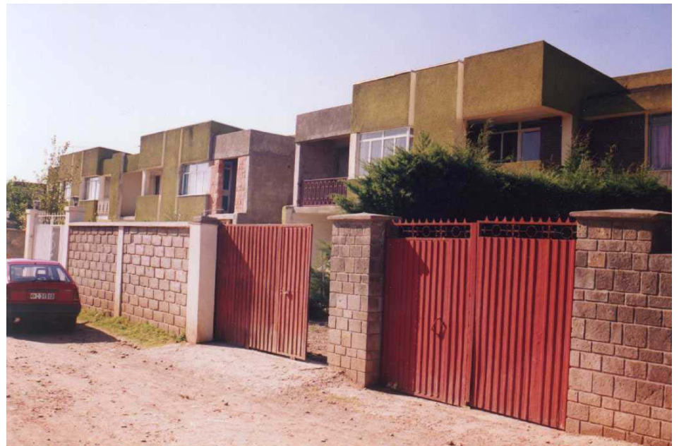
Building project with incomplete infrastructure in Bole area