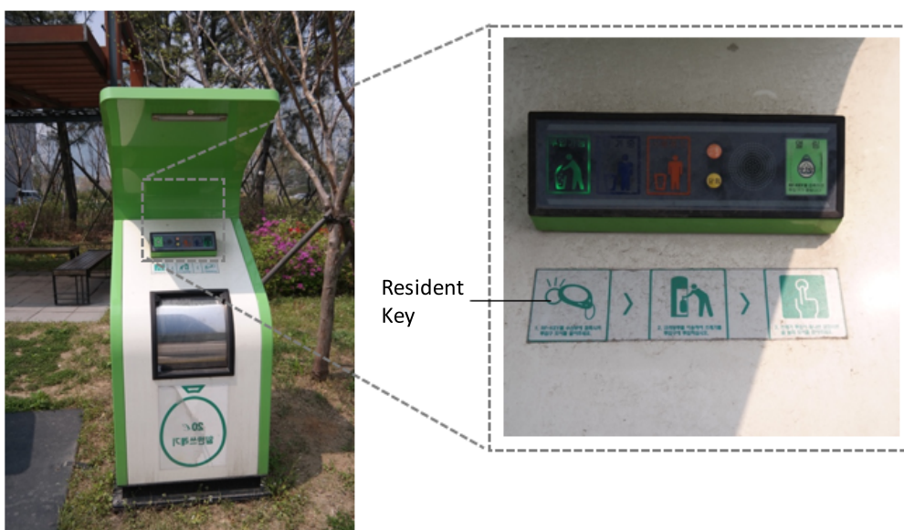
Figure 3. Photo of street-accessed waste bin system. Source: Author (20 February 2015).

In the case of universities, Sonn et al. observed that creating "a new Korean university is still forbidden, but a new campus of an existing Korean university is allowed" (Sonn et al., in press, p. 10). As of 2016, three existing Korean universities have established secondary campuses in Songdo: Incheon University, Incheon Catholic University, and Yonsei University. For instance, from 2013, Yonsei has made it compulsory for all first-year students to attend and live on the Songdo international campus (IFEZ, 2014). Despite an influx of students, a lack of amenities that students are typically accustomed to in Seoul has